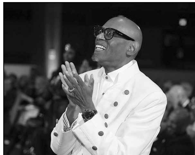
Bishop Paul S. Morton

of God's word, and bringing about salvation, healing, deliverance and restoration for the continued up-building of God's Kingdom.