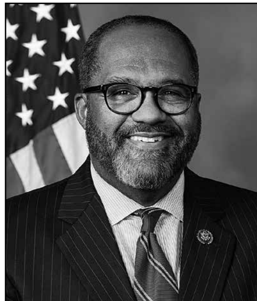
Congressman Troy A. Carter, Sr. (D-LA) District 2.

The proposed legislation underscores a united commitment to revitalizing American port infrastructure and reinforcing the nation's maritime dominance through innovation, job growth, and strategic investment.