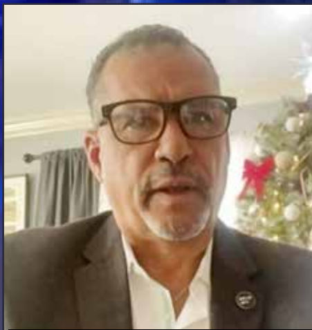
Oliver Thomas New Orleans City Councilmember District E