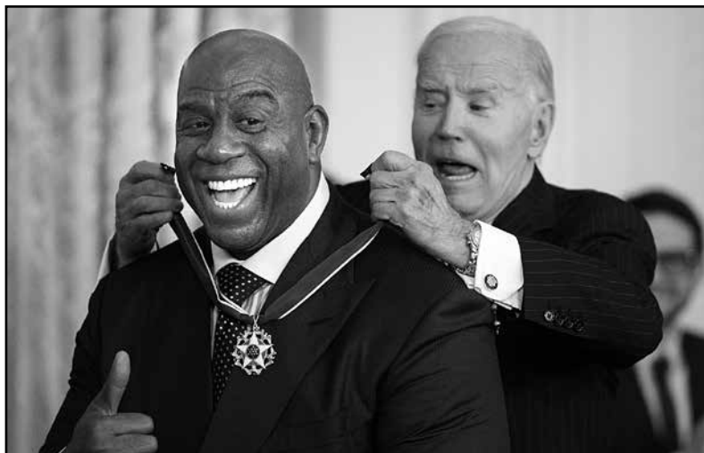
President Joe Biden giving Presidential Medal of Freedom to sports legend, entrepreneur and humanitarian Earvin "Magic" Johnson. He was one of 19 recipients of the nation's highest civilian honor that took place on Jan. 4, 2025.

"You all literally embody the nation's creed, e pluribus unum – out of many, one," Biden told the recipients during the ceremony in the White House East Room. "You feed the hungry. You give hope to those who are hurting, and you craft the signs and sounds our movements and our memories."