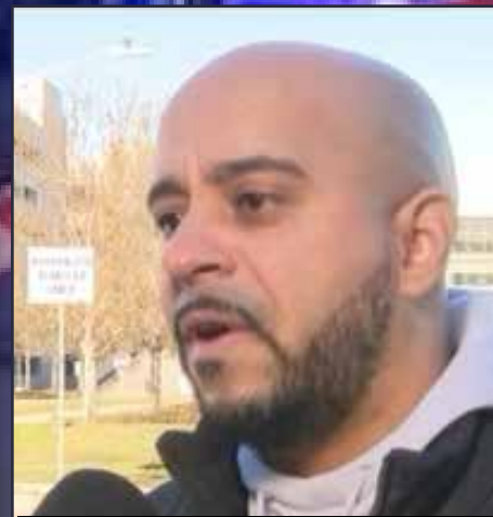
Royce Duplessis Louisiana State Senator District 5