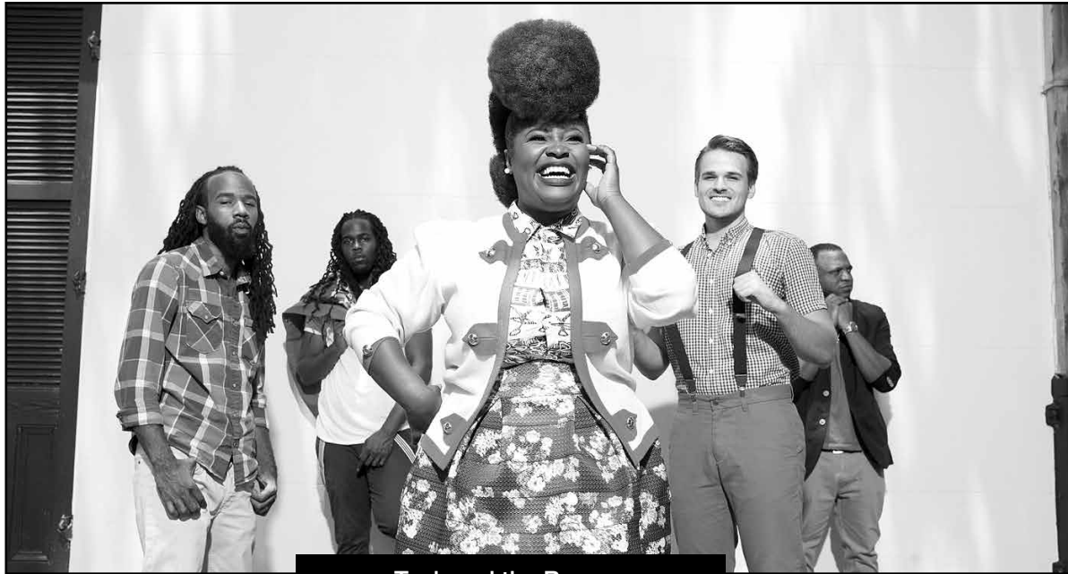
Tank and the Bangas

Afro-Cuban Funk Sensation, CimaFunk, now a New Orleans resident, celebrates his third Grammy nomination for “Pa’ Tu Cuerpa”, which is up for Best Latin Rock or Alternative Album.