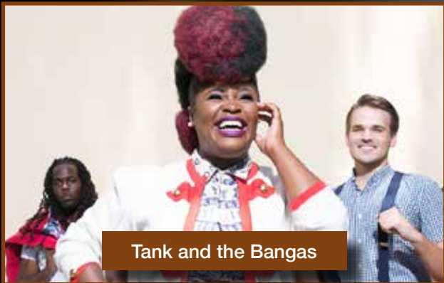
Tank and the Bangas