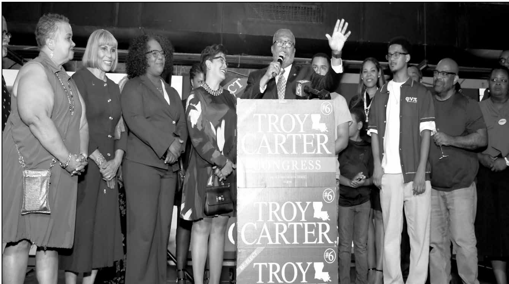
Troy Carter surrounded by family, friends and supporters after being re-elected to represent Louisiana 2nd Congressional District. In his speech he spoke about his record of getting things done by building coalitions among Democrats, Republicans and Independents.