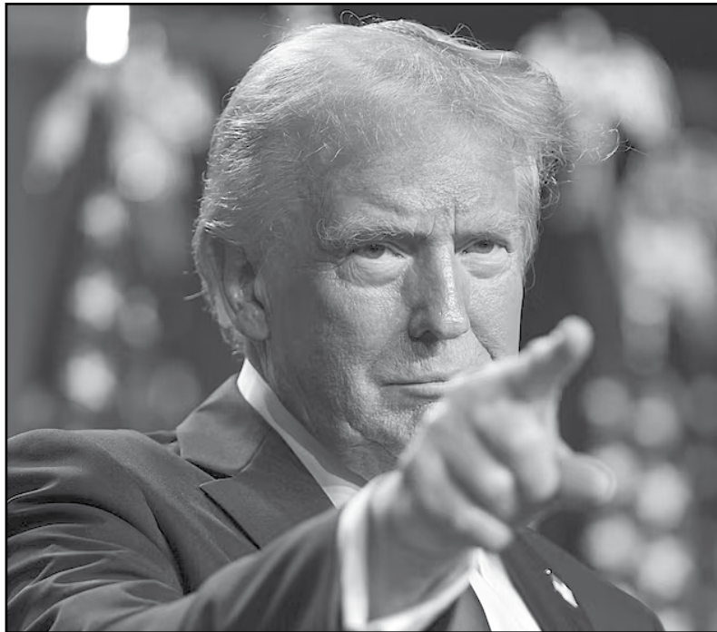
President-elect Donald J. Trump.

Donald Trump has been elected president, defeating Democratic opponent Kamala Harris. As of Wednesday morning, Trump has won at least 270 electoral college votes, with results still coming in.