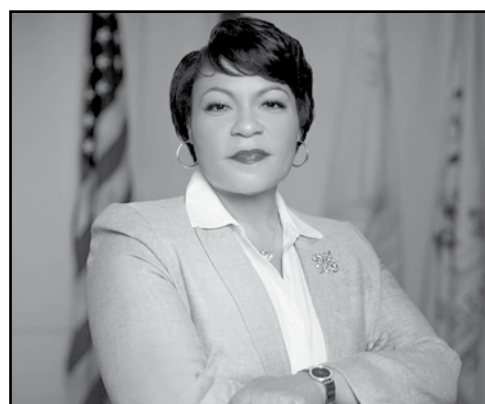
Mayor LaToya Cantrell

Three winners will be selected from the entries and given a unique chance to step into the role of Mayor, shadowing Mayor LaToya Cantrell to learn firsthand about the responsibilities and decisions involved in city leadership. Winners will also have the opportunity to hold