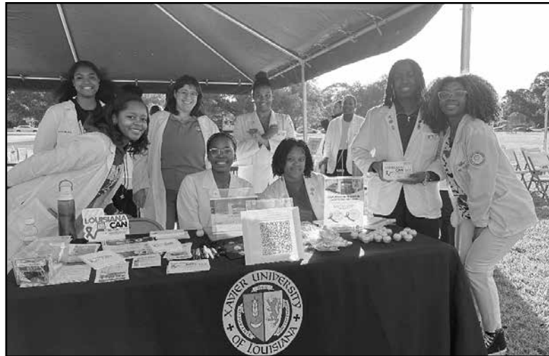
Many came out to take part in the UNCF Walk for Education. It is a truly worthy cause to support the next generation to strive for excellence.

Community organizations such as Crescent Care, Blue Cross Blue Shield, Bayer Pharmaceutical