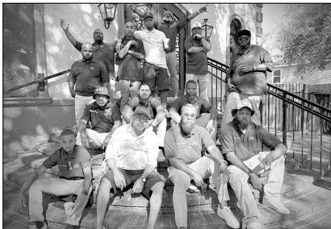
New Orleans Men Buckjumpers