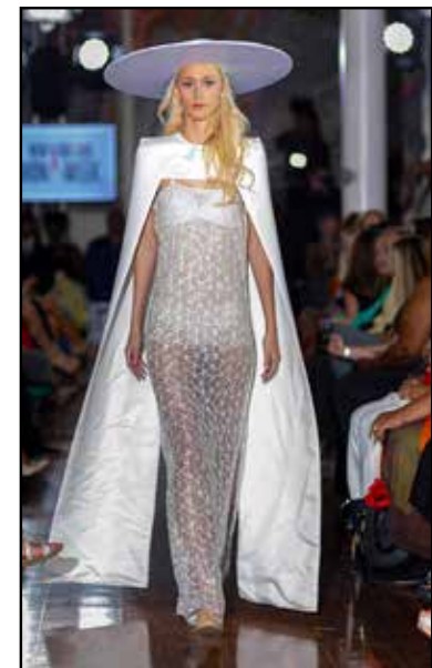
Left to Right: r polka-dot top with maxi paint skirt, by Designer Casme, The BreakRoom Smash; Birdcage headpiece, black fringe dress with statement belt, Designer Kate Fusilier, Blingdana,Paint splattered olive green bubble coat, Paint splash, navy blue overall with crossbody bag, both by Designer Casme, The Break Room Smash; Monochromatic royal blue suit with silver embellishment and matching button front shirt, by Reggie Hammonds, BillieRaye; Raspberry 2 piece set, halter cowl neckline top,matching fitted floor length skirt, by Romey Roe; White vest with beading and sheer pants; White sheer flowing dress with handbag; White lace off shoulder dress with spike gold necklace, gold belt and white hobo bag, all by Designer Sophie Omoro, odAomo; White sheer sequins gown with white cap and oversize hat by Romey Roe; Royal blue corset over white button front top, maxi skirt with silver embellishment by Reggie Hammonds, BillieRaye.