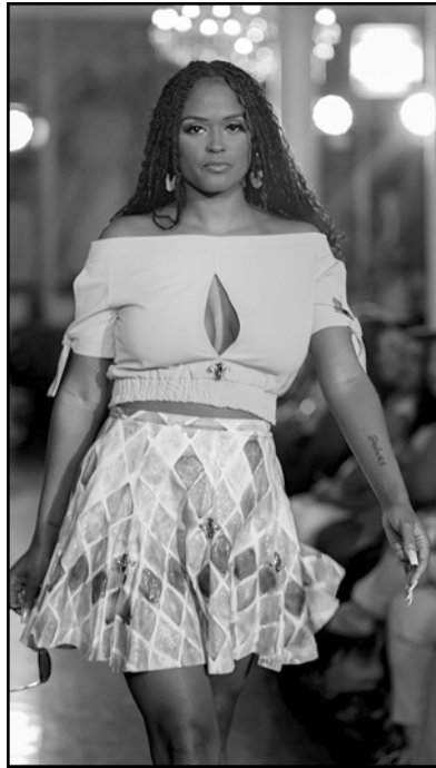
Left to Right: Mix print with polka-dot and pattern swing dress, and sunshine yellow off shoulder crop top with keyhole cutout and print pattern swing skirt both by Designer Marnita Miller, EFABB.