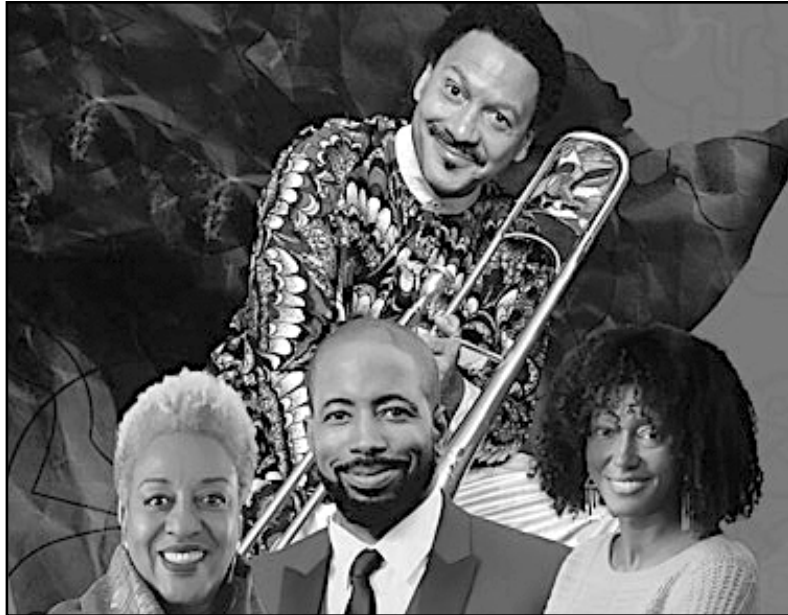
Delfeayo Marsalis New Orleans debut of a composition that speaks to the ongoing experience of African-Descended Black people worldwide

When asked about his inspiration for composing the theme music for the ADC, Marsalis expressed a desire to convey the Emotional Essence of the Consortium, aiming to make it more relatable to a broader audience. The new composition,