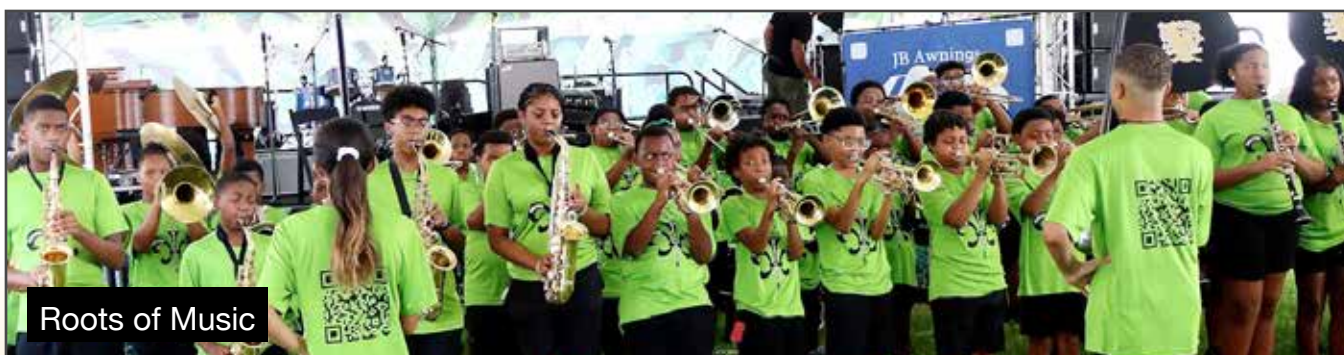
Roots of Music