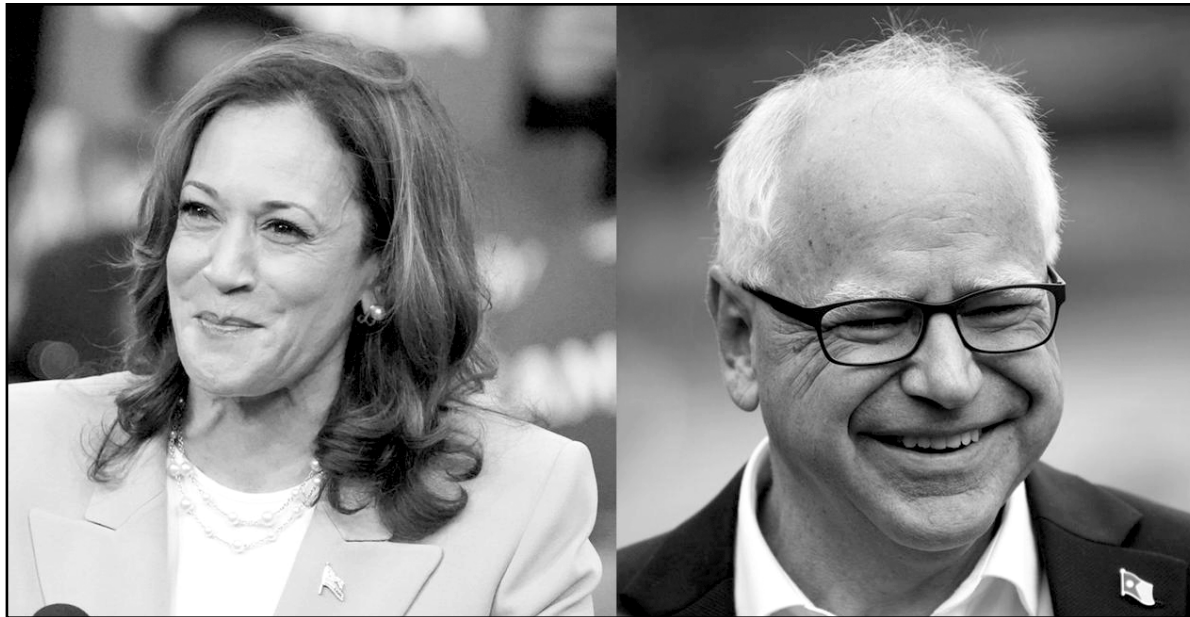
Democratic Party Presidential Nominee Kamala Harris has selected Minnesota Governor Tim Walz as her Vice-Presidential pick in the 2024 race for the White House.

Walz, a Nebraska native, enlisted in the National Guard when he was 17 and served for more than two decades, with both domestic and overseas deployments. He later was a high school social studies teacher and football coach in Mankato, about 80 miles south of Minneapolis, before he won a congressional seat in a largely rural and agricul-