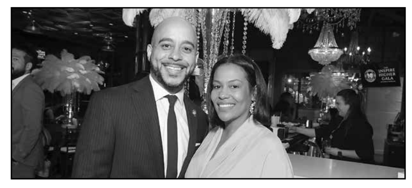
State Senator Royce Duplessis and wife Krystle celebrating InspireNOLA and the work they do to positively impact the lives of young people in the City of New Orleans.