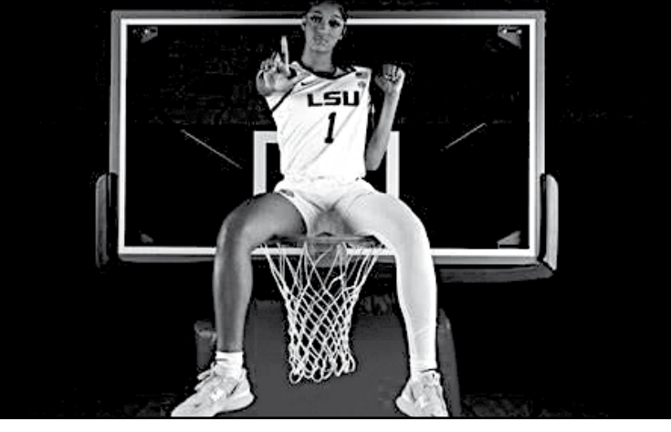
Angel Reese is an example of a young Black woman who's worked hard to become successful as an athlete and businesswoman.

While criticisms of the LA Times article came from every direction and had to be walked back by the writer and the newspaper, it speaks to the larger problem of racism and misogyny in American