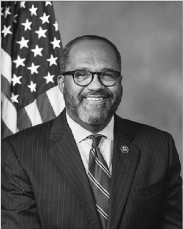
U.S. Representative for Louisiana's 2nd Congressional District