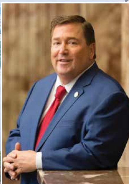
William "Billy" Nungesser Lt.. Governor