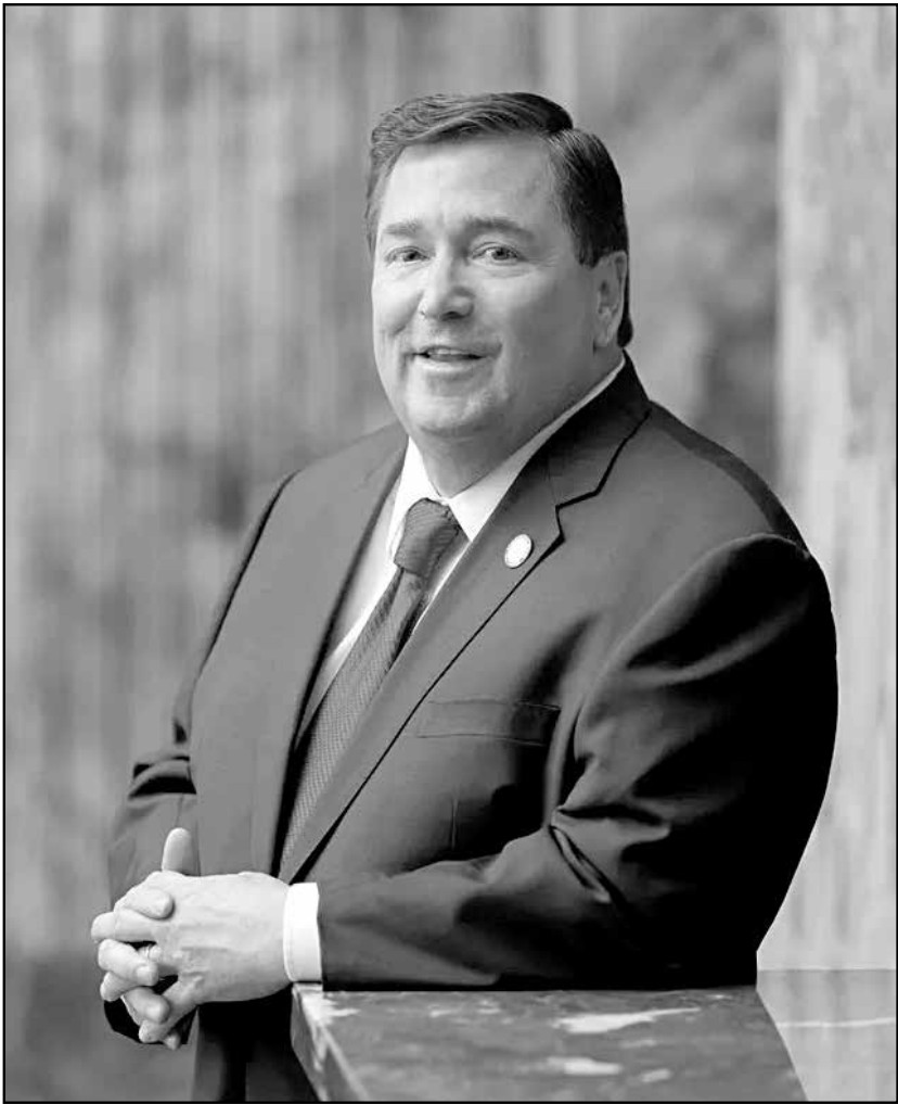
William "Billy" Nungesser - Lt.. Governor

In these perilous and divisive times for our Democracy, it is important that we as a community get out and vote. Not simply voting but putting our power at