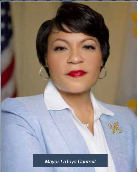
Mayor LaToya Cantrell