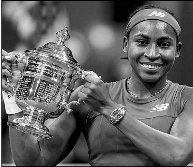
Tennis Phenom CoCo Gauff blazing a trail for a new generation of African Americans in the world of tennis.

As Gauff accepted her winner's check of $3 million, she took a moment to graciously thank tennis legend Billie Jean King, who stood alongside her on the stage. The gesture highlighted Gauff's perspective, humor, and charm that has set the stage for American sports' next global superstar.