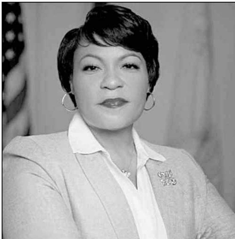
New Orleans Mayor LaToya Cantrell

Prior to her tenure in Oakland, Kirkpatrick served as Bureau Chief in Chicago, where she was the liaison to the Department of Justice (DOJ) while the Chicago Police Department was under investiga-