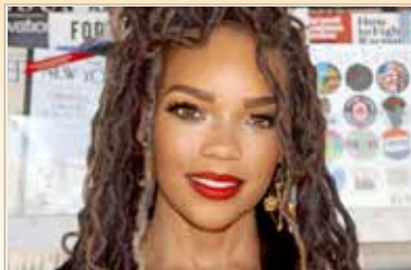
Diva Dionne Character Female Empowerment Columnist

There is a certain flow we must all have in order to sustain comfortability to progress in the world – but when you’ve survived a disaster like Hurricane Katrina whereas many were left to provide and resolve things on their own, one can become overwhelmed with adapting and learning new ways to provide even in the midst of an unforeseen new world.