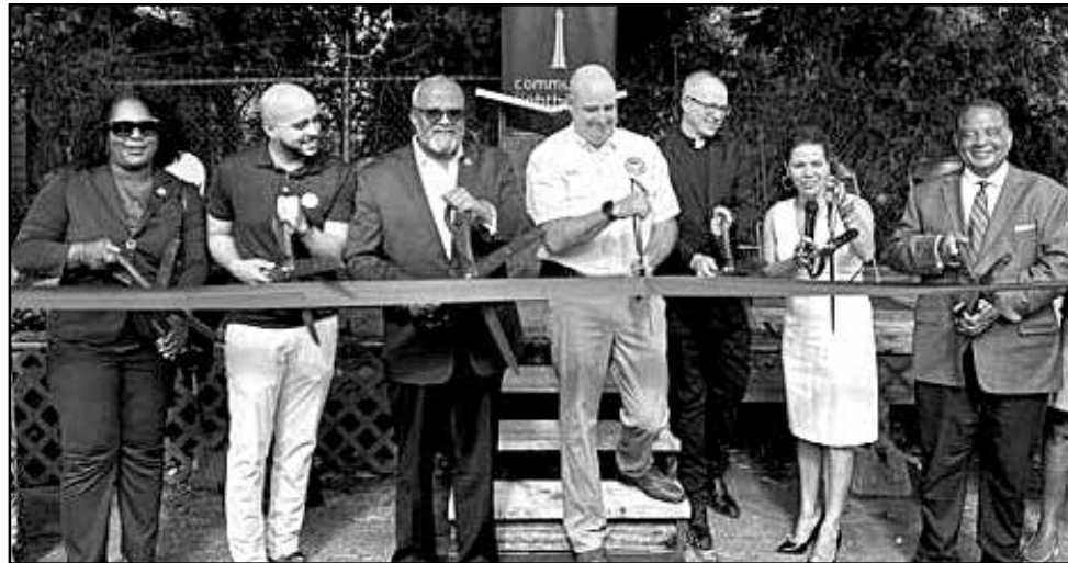
Congressman Carter continue to champion many causes important to the citizens of his district and statewide. Recently, he and other city and state leaders appeared at a ribbon cutting promoting hurricane preparedness and resources available.

Louisiana disaster survivors are urged to register for federal disaster assistance with FEMA. Individuals and business owners in the designated parishes who had storm or flood damage should register for "Individual Assistance" with FEMA