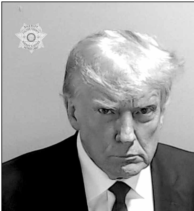
Former U.S. President Donald Trump

However, once in Atlanta, authorities processed Trump and eventually released him from