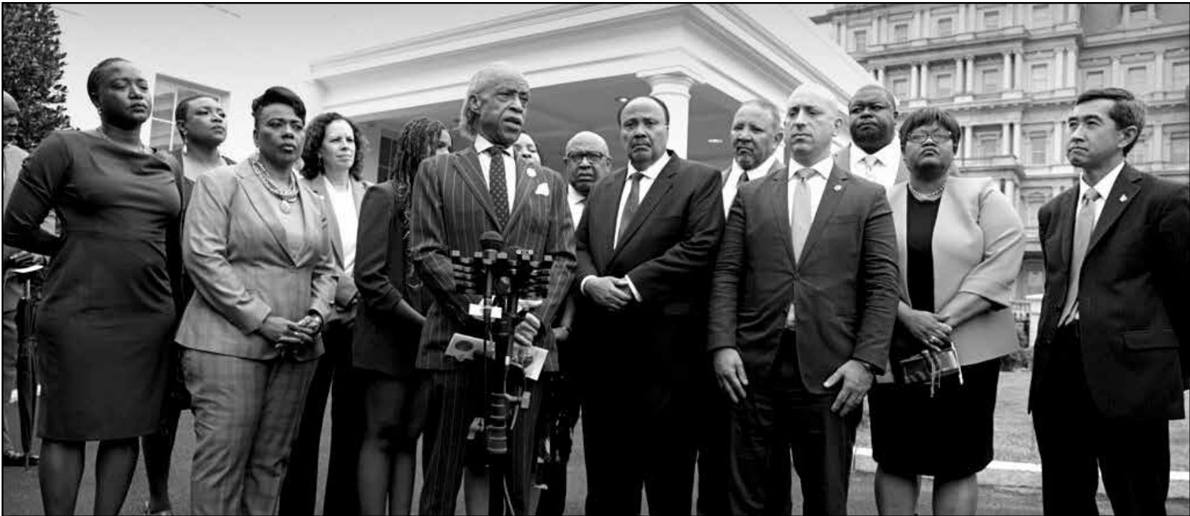
National Civil Rights leaders recently met with President Biden to discuss their agenda around issues of equity.