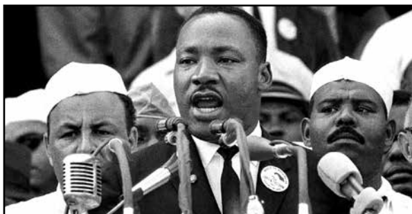
The struggle for justice, freedom and equality continues sixty years after the historic March on Washington.

continuity and recognizing all those who played a role. However, Chavis was spotted among the crowd giving a hug to an unidentified Jewish man who had singled him out. "We were here 60 years ago, and we were both 15," the man said to Chavis.