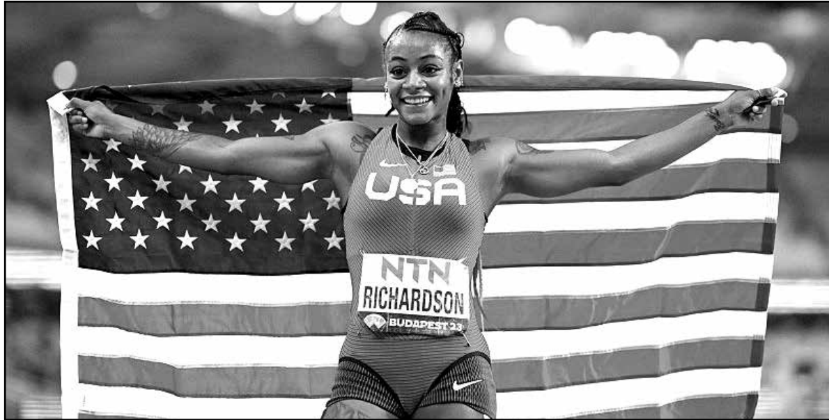
Sha' Carrie Richardson dominates the world stage in women's track and field meet at World Championships.

Richardson, an underdog coming in, became the American since