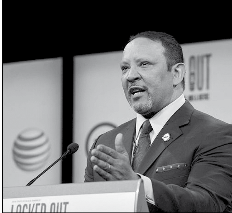
National Urban League President/CEO Marc Morial

Reflecting on his 20-year leadership of the National Urban League, Morial highlighted the organiza-