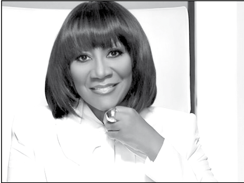
Musical legend Patti LaBelle

The more attention I pay to my health, the better I feel. Exercise and I are not friends, but I started becoming more active – whether walking my dog and exercising in my pool or hopping on the elliptical machine. I use my Dexcom continuous glucose monitor (or CGM)