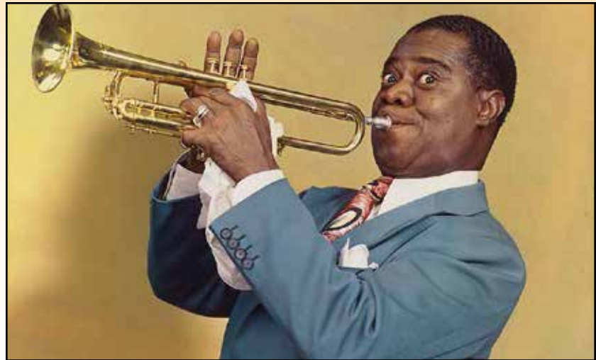
Legendary musical ambassador Louis "Satchmo" Armstrong