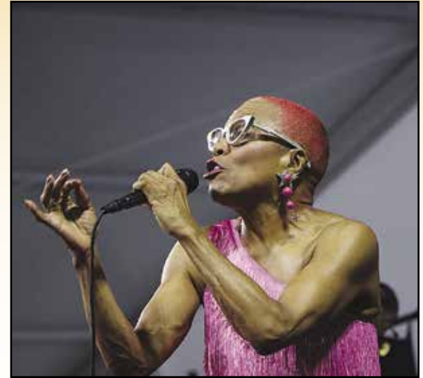
Dee Dee Bridgewater.