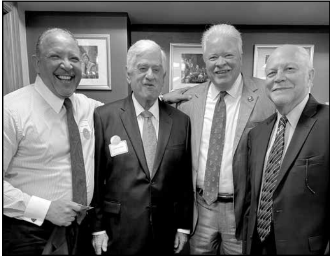
Marc Morial with other former State Legislators who were honored recently.