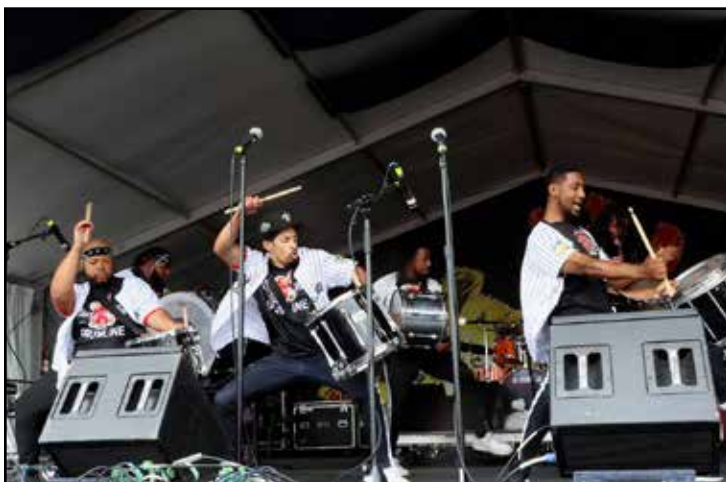
Black Magic Drumline