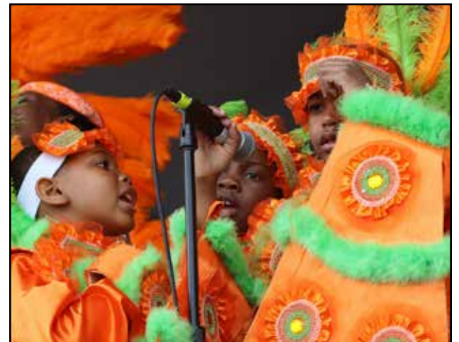
Creole Wild West kids