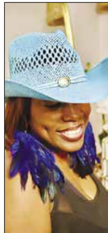
Turquoise Cowboy Hat and Earrings – Electrify U Boutique