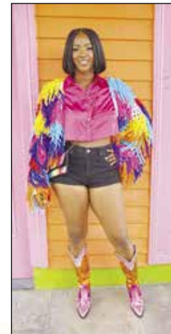
Rainbow Crop Style Fringe Jacket and Black Shorts – Pop Culture NOLA