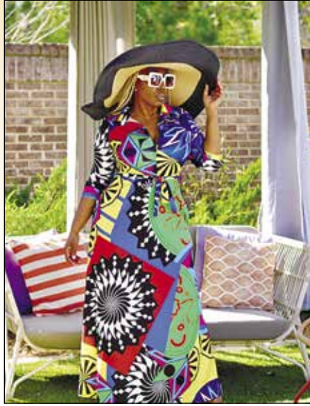
Multicolor Print Maxi Dress – Electrify U Boutique