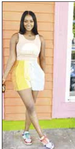
Paste Multicolor Shorts and Graphic Tee – Pop Culture NOLA