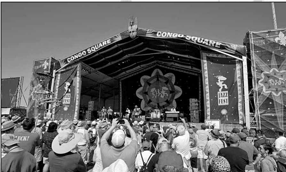
Jazz Fest 2023 is back and better than ever. With amazing music, food, and countless vendors, it promises to be a great event.