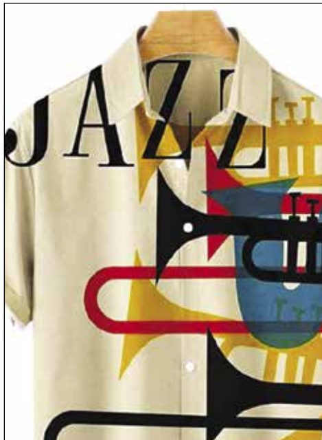
Jazz Trumpet Short Sleeve Shirt – Royaura