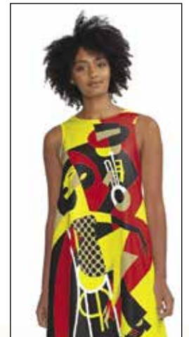
A-Line Loose Fit Print Dress – Redbubble

Visit www.ladatanews.com for more photos from these events.