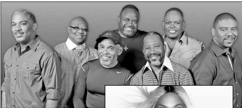
Frankie Beverly and Maze