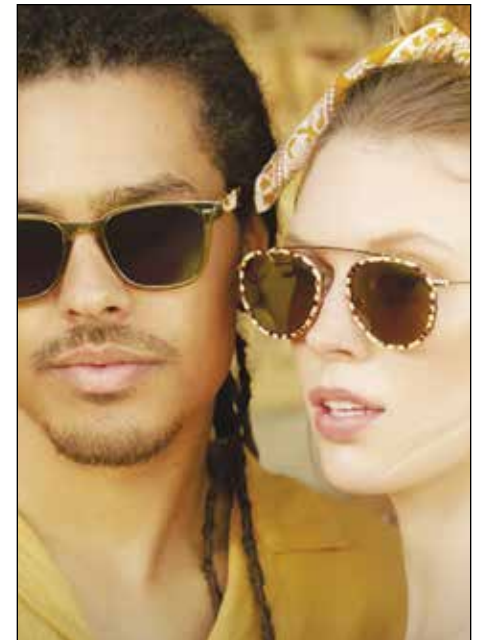
Sunglasses – Krewe du Optic