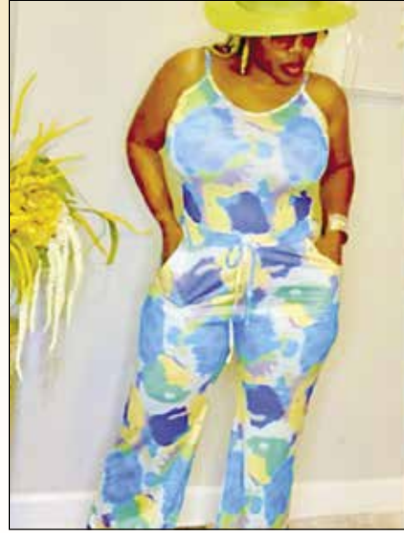
Tie Dye Pants Set – Electrify U Boutique