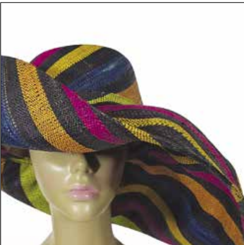
Zanna Raffia Hat – Black Art Depot