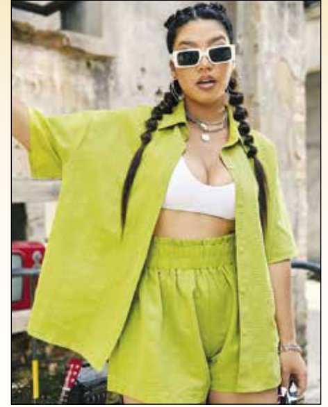
Green Short Set – Shein