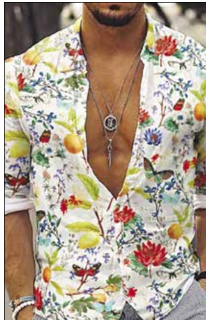
Graphic Floral Print Long Sleeve Shirt – Light in the Box