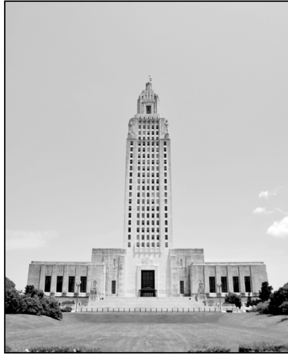
Louisiana Lawmakers will begin their Legislative Session with many issues that impact people across the state. One is the issue regarding the future of abortion, where several bills will be up for debate.