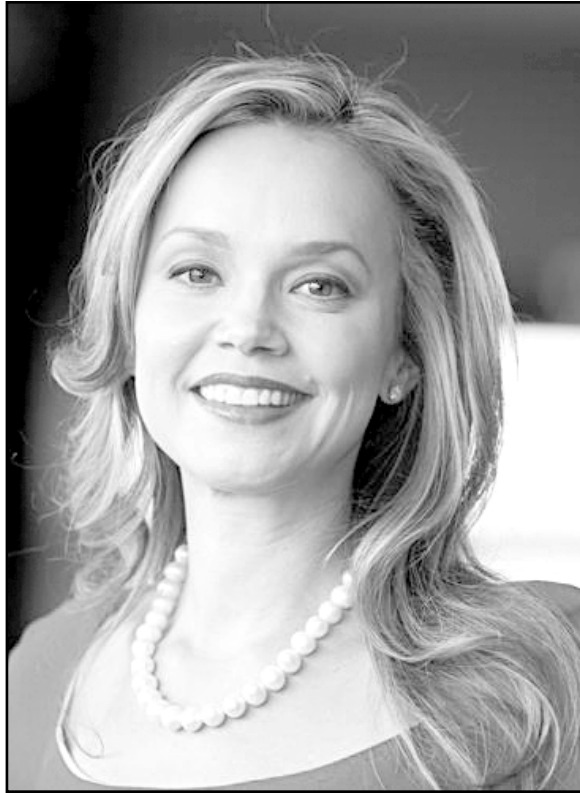
City Councilmember-at-Large Helena Moreno.

The legislation for consideration is also in line with what most Louisiana residents support, according to a poll released today by LIFT Louisiana and conducted by JMC Analytics. The poll results show that 73% of respondents support abortion if it is in the doctor's best medical judgment, and 59% oppose criminal penalties for a physician who performs an abortion. For rape and incest exceptions, 70% of respondents support these exceptions.