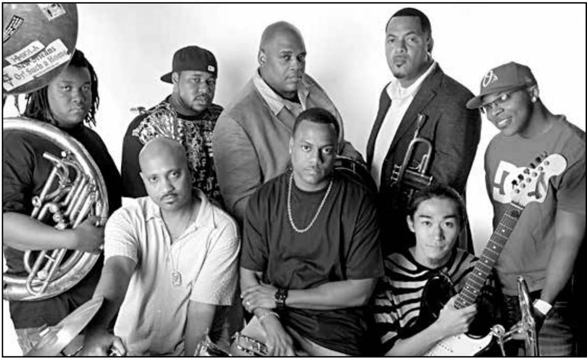
Soul Rebels Brass Band