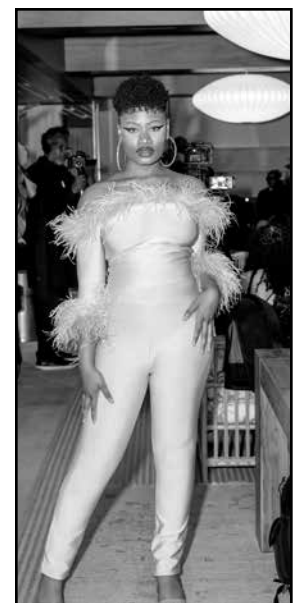
Blush tone, neoprene, long sleeve jumpsuit with ostrich feather detail.