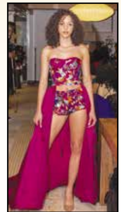
Multi color sequins, matching bustier and short set with train.