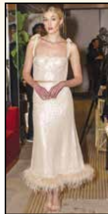
Gold, two-piece sequins skirt set with ostrich detail on hem.