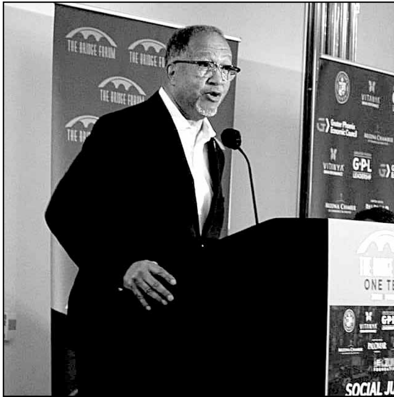
Dr. Benjamin F. Chavis Jr., President and CEO of NNPA.

The organization then played a tribute video that included Dr. Chavis' family and his legendary career as a civil rights leader. "As the new co-chair of No Labels, I'm proud to continue to be the president and CEO of the National Newspaper Publishers Association on the 196th anniversary of the Black Press of America," Dr. Chavis stated. "Working with former Sen. Joseph Lieberman and former Gov. Larry Hogan as co-chairs, I believe this will lift up the Black Press of