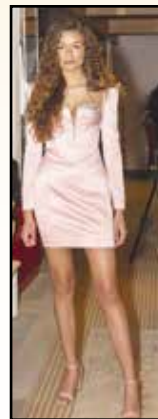
Blush pink, corset style top with long sleeves and fitted bodice.