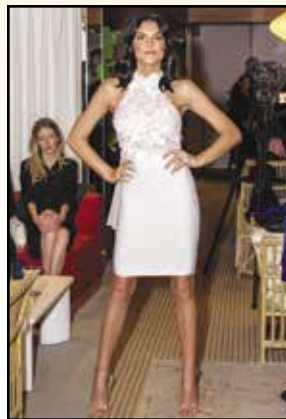
Off-White, bodycon dress, with lace racer style halter top and fitted bodice.