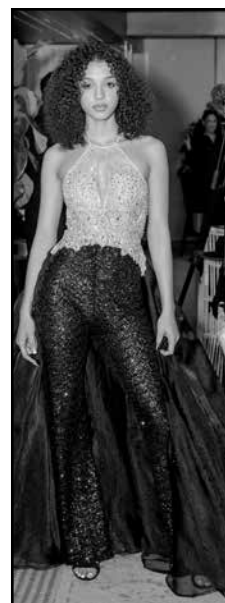
Champagne, sequins halter top, black sequins pants with tulle train.