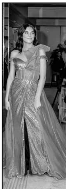
Purple, iridescent, full-length gown with chiffon overlay cummerbund, shoulder bow and drape.

The weeklong event concluded with R'Bonney Nola Gabriel, Miss USA, a 28-year-old from Texas being crowned as the 71st Miss Universe.