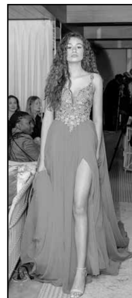
Red, full-length gown with silver sequins applique on top, and multi-layered skirt with split.