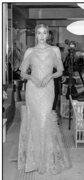
Tangerine, full-length gown with sequin applique, chiffon drop shoulders and chiffon pleats.