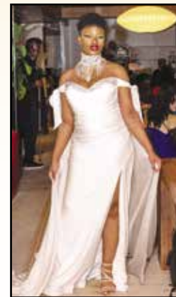
White, silk-like full-length gown with drop shoulders, high split, and choker.