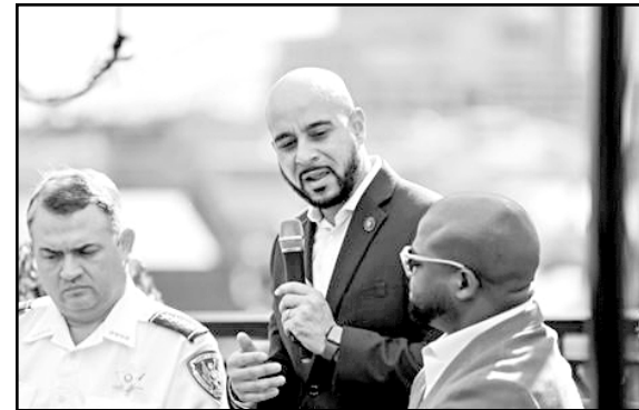
Louisiana State Senator Royce Duplessis takes part in meeting with the chiefs that the goal was to answer questions relating to providing long term strategies for safer communities.