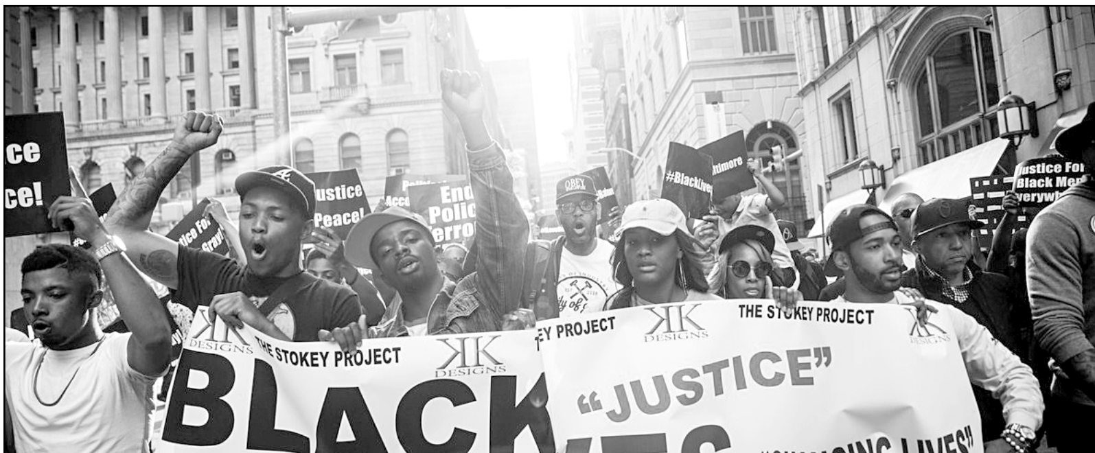
Today a new generation are taking up the cause for freedom, justice and equality.

Ultimately, it will take a holistic approach to combat the forces that are working against efforts to make this country one that is true to its founding principles for all its citizens. Today it is incumbent to truly be a nation working towards becoming a more perfect union. Moreover, one where all people are not only created equal but treated equally. Indeed, getting there this is the task of all Americans. To begin to build bridges of understanding into our common humanity regardless of our race, gender, class, creed, color, religion, and sexual orientation, and whatever divides us. If we use this as our North Star, which is defined as symbol of inspiration and hope, then we can make the Dream of not just Dr. King, but the American Dream a Reality.