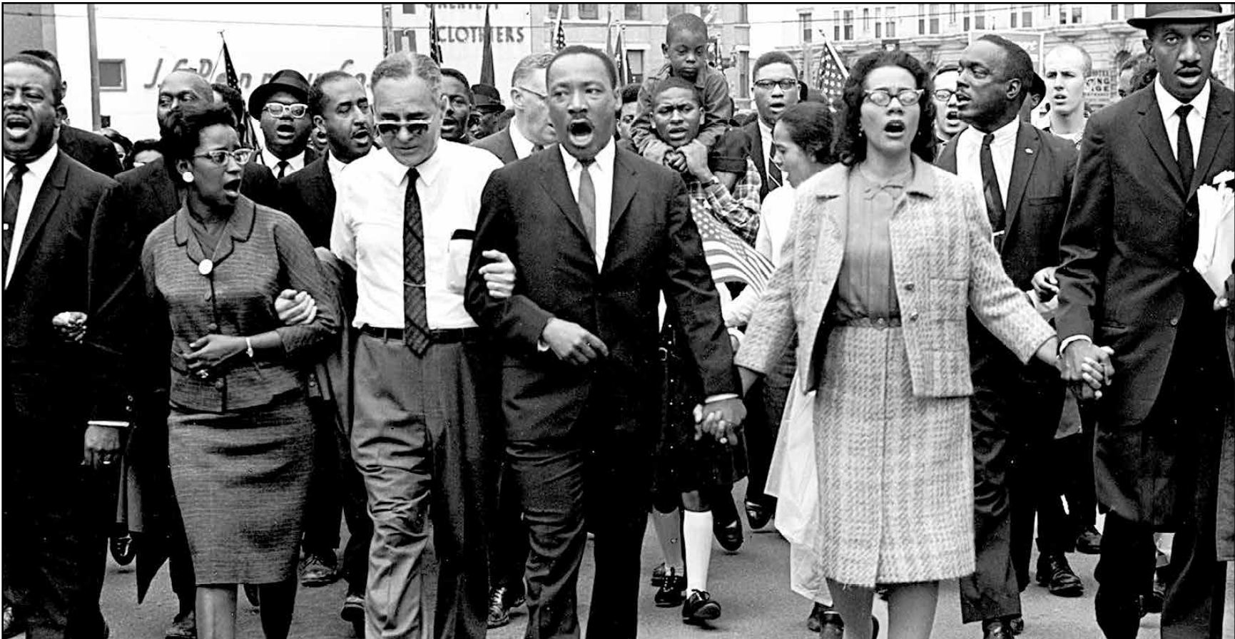
The Civil Rights Movement had people from many walks of life who were committed to justice for all. While the movement created change and opportunities for African Americans there is still a long way to go before the Dream of MLK becomes a reality.

Edwin Buggage Editor-in-Chief Data News Weekly