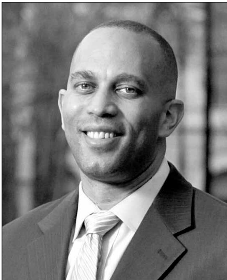
Hakeem Jeffries is making history as the first African American to lead a major political party in the United States House of Representatives.

Throughout Jeffries' speech, Trump supporting Republicans jeered while Democrats rose to applaud the Brooklyn born congressman.