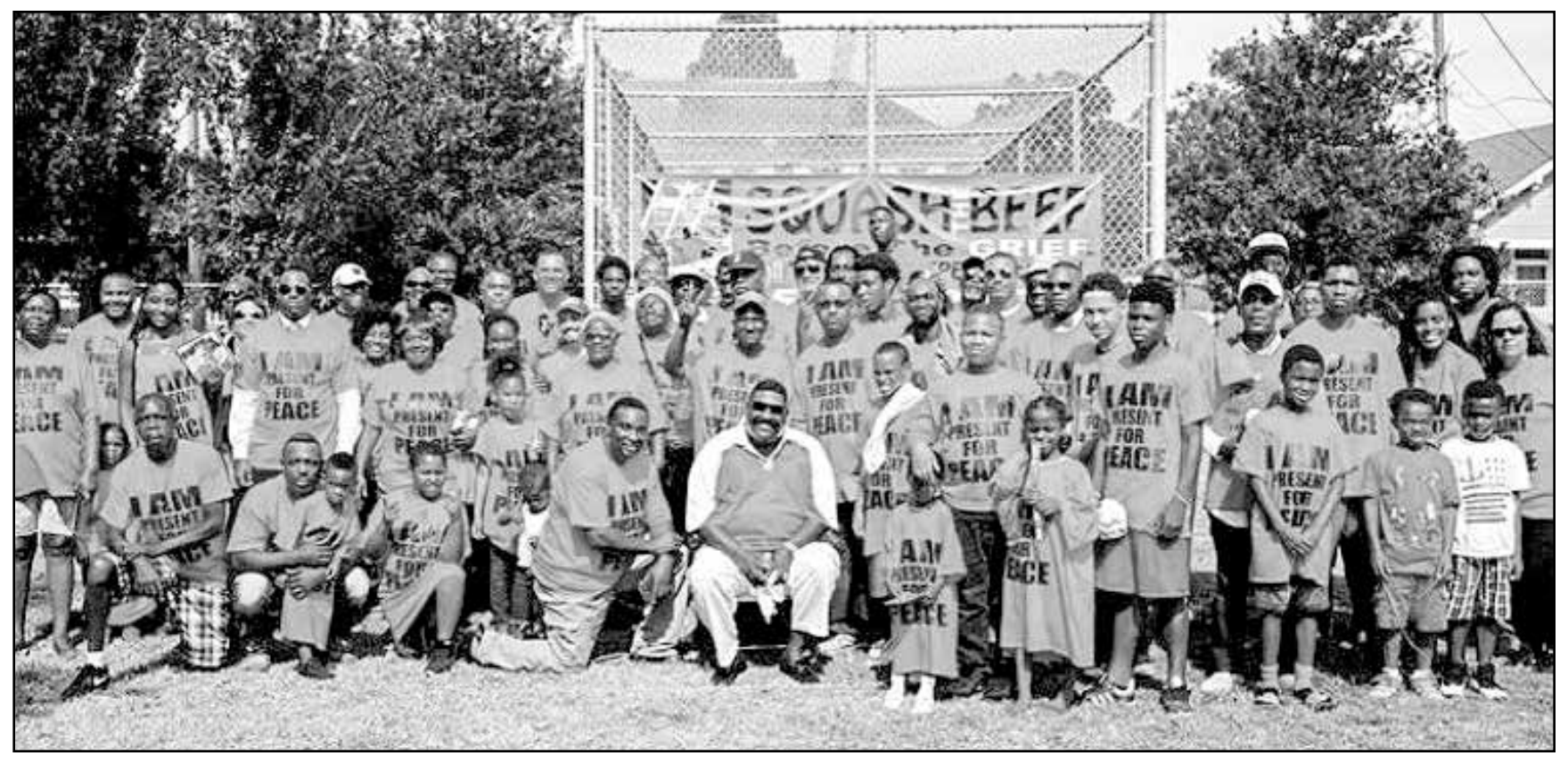
The Peacekeepers is a group of citizens from different backgrounds committed to reducing violence in the City of New Orleans. They have a successful record of working in the community showing that it can be done.

The Peacekeepers: Offering Solutions to Crime and Gun Violence in New Orleans