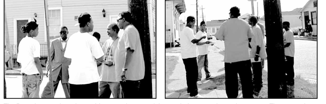
The Peacekeepers have been able to reach many of the youth that some have given up on. They not only work on conflict resolution, but also help young people believe that they can change the course of their lives and become assets to the community.

The Peacekeepers have done much of their work on a grassroots level but would like to have a seat