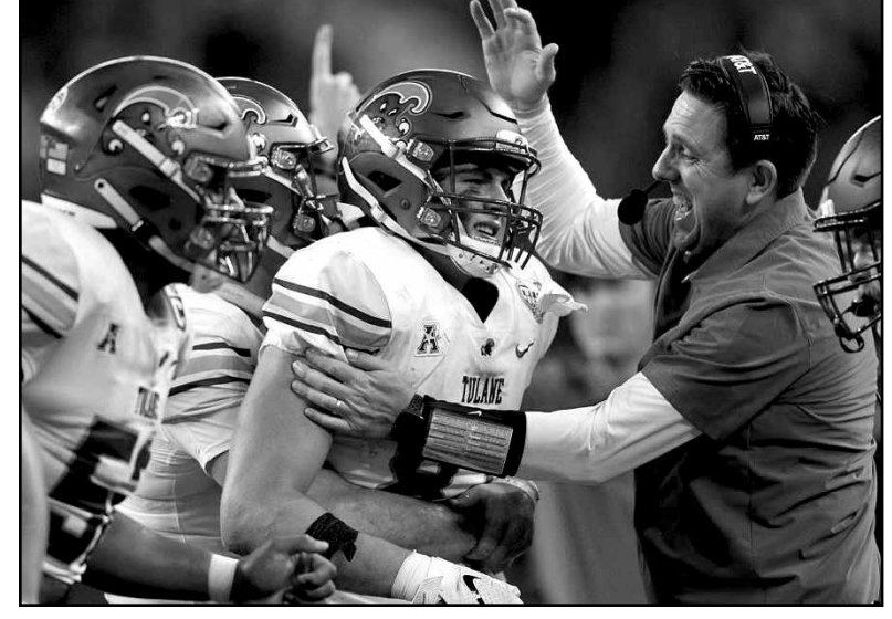
LSU and Tulane showcased the best of Louisiana College football. Both having amazing seasons and winning their Bowl games.