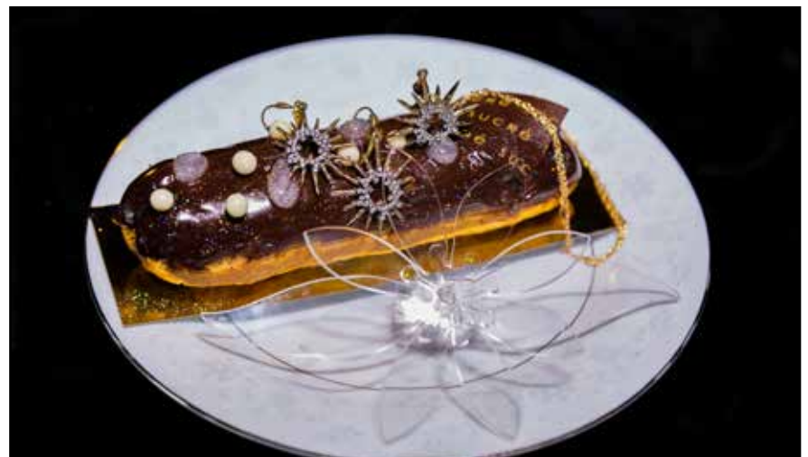
Haute Chocolate: Antique brass and crystal Cosmo earrings and pendant provided by Designer Jess Leigh; Clear plastic oversize floral ring provided by Designer Stern