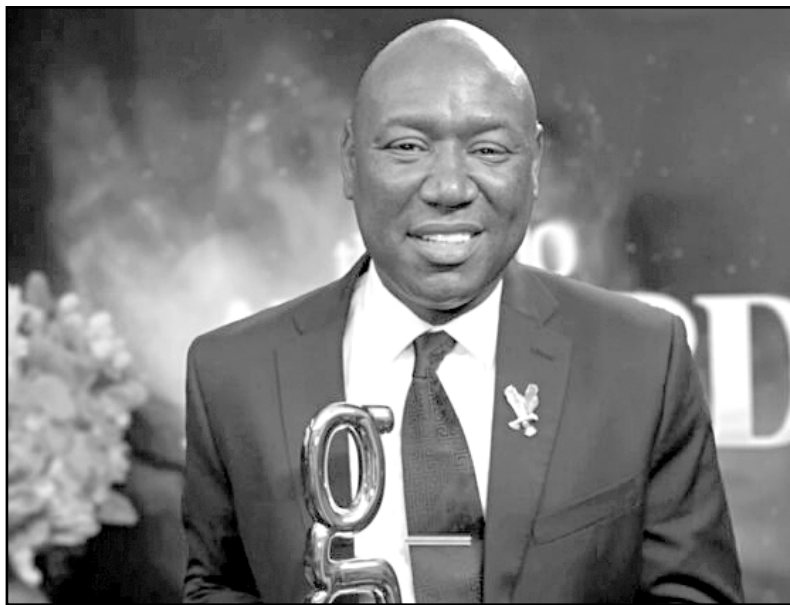
Attorney Ben Crump

Crump, who has represented the families of George Floyd, Breonna