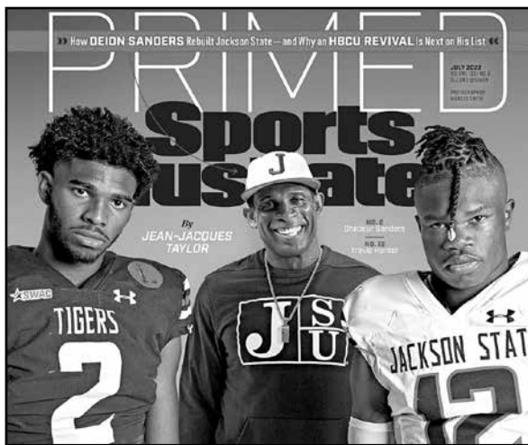
Coach Deion Sanders made the cover of Sports Illustrated in June 2022 for his successful run as Head Coach at Jackson State University.

Prime, who is a Florida native, brought national broadcast networks and major celebrities back to the HBCU campus to spotlight the iconic half-time performances and the tailgate experience, as well as the talent. "Coach Prime's" main