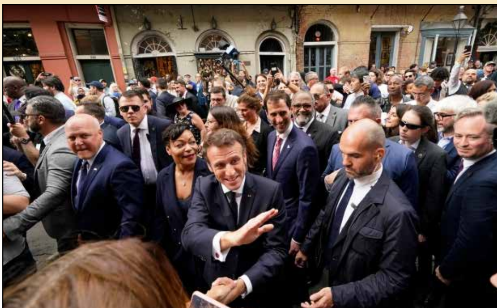
French President Emmanuel Macron greets crowd during his visit in New Orleans. He was surrounded by local leaders that included New Orleans Mayor LaToya Cantrell, Mitch Landrieu, Senior Advisor to President Joe Biden, and Troy Carter, Louisiana Congressman.

Macron's New Orleans visit also included a stop at the Cabildo, where ceremonies marking the land transfer were held.