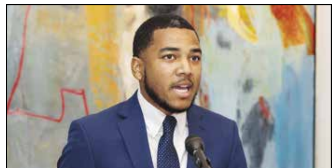
Mayor Tyrin Z Troung- Bogalusa 23 years old