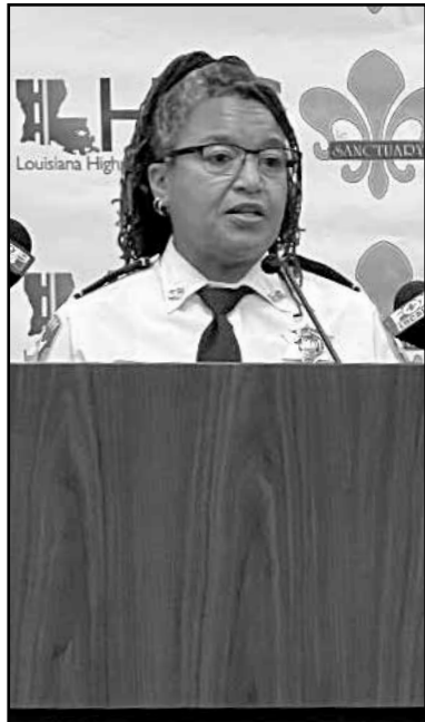
New Orleans Criminal Sheriff Susan Hutson.