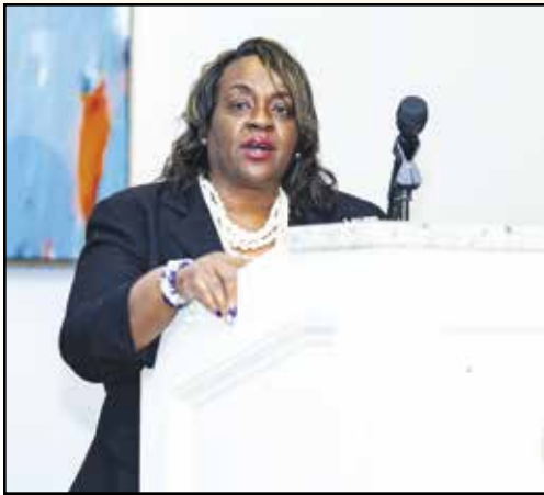
BR State Sen Regina Barrow