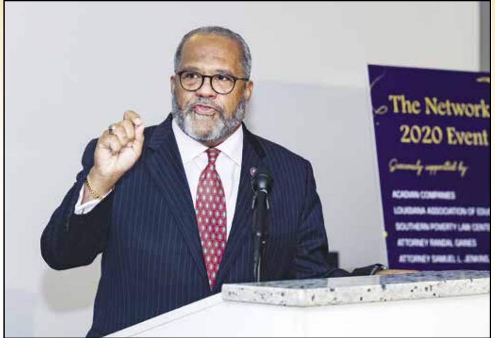
Congressman Troy Carter