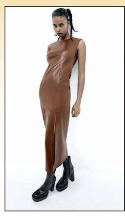
Brown, faux-leather ankle-length, sleeves, front slit, fitted A-line dress from Zara.