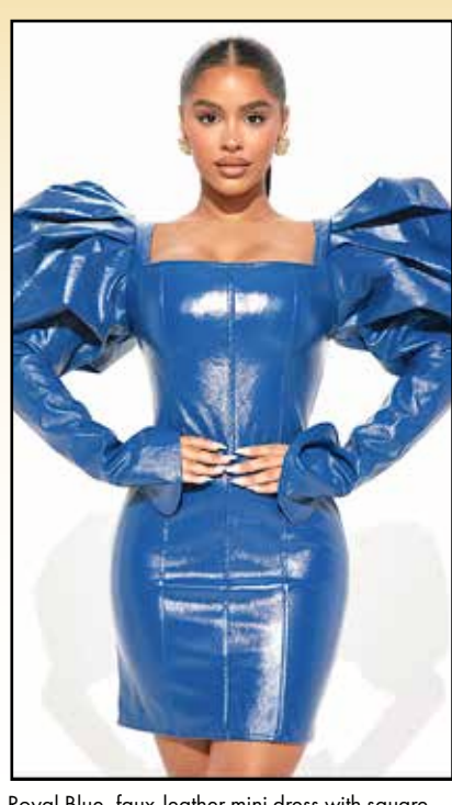
Royal Blue, faux-leather mini dress with square neckline, puffed sleeves from Fashion Nova