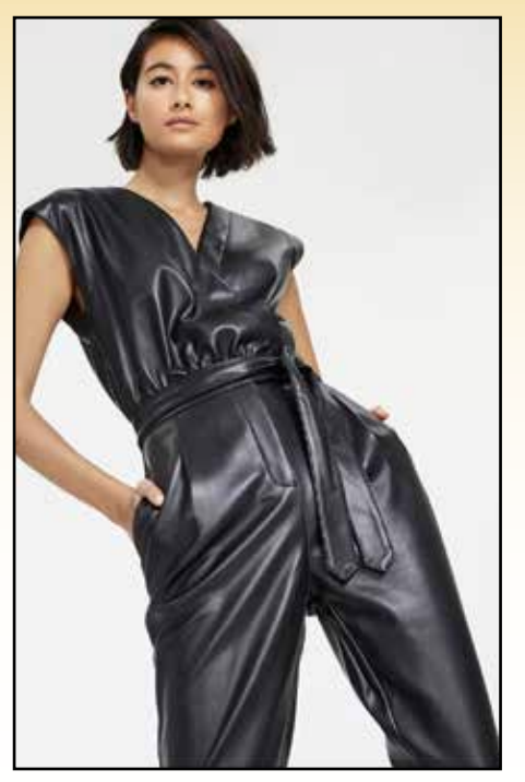
Black faux-leather, one-and-done, jumpsuit with cap sleeves, plunging neckline and tie-belt, side pockets from I.N.C. Concepts at Macy's.