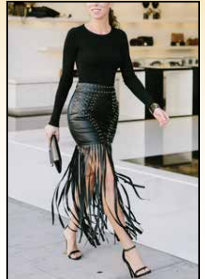
Black Leather Fringe Skirt with Gold Grommet – sydnestyle.com