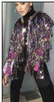
Rainbow Tinsel Fringe Jacket – etsy.com | utinnyc