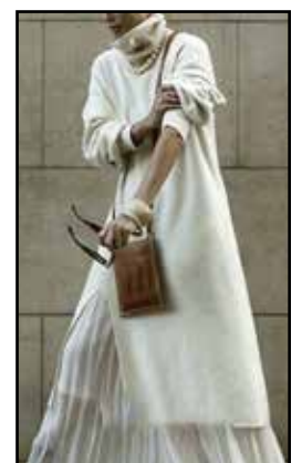
Winter White High Neckline Shift Dress – dressisi.com

As the temperature finally starts to cool down, fashion aficionados can feel a subtle, but recognizable change in the air; and suddenly putting on sundresses and sandals doesn't feel quite enticing. It's time for fall fresh fashion trends to surface and make its debut into the fall season.