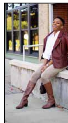
Camel Color Faux Suede Leggings & Brown Riding Boots