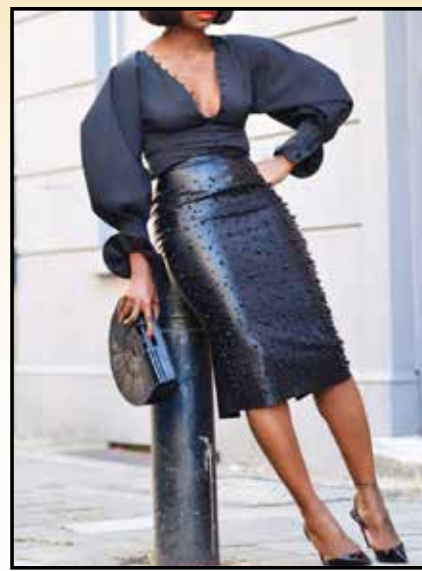
Black Beaded High-Waisted Pencil Skirt – uhstar.com