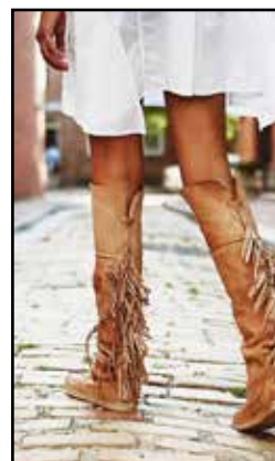
Beige Fringe Lace Back Moccasin Boots – freepeople.com