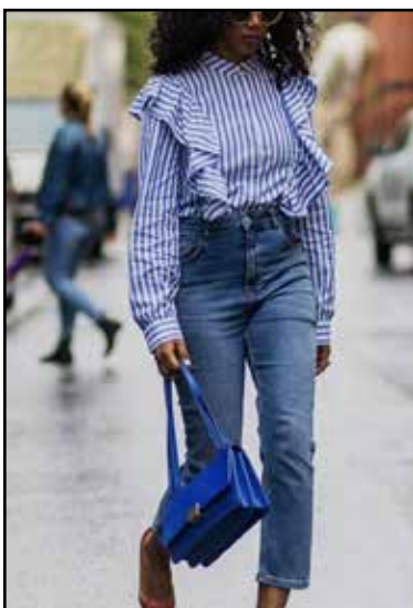
High-Waist Mom Jeans, Blue Stripe Long Sleeve Ruffle Shirt – purewow.com