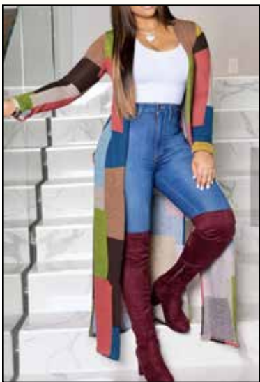
Maxi Style Block Color Cardigan & Burgundy Over-the-Knee Boots – stylewe.com