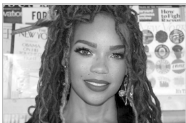
Diva Dionne Character Female Empowerment Columnist

There's a fire burning in all of us screaming to be reactivated with joy and intentions but until you start slowing down you won't be able to connect with the power that comes with the elements of Activation, Passion, Creation, and Doing.