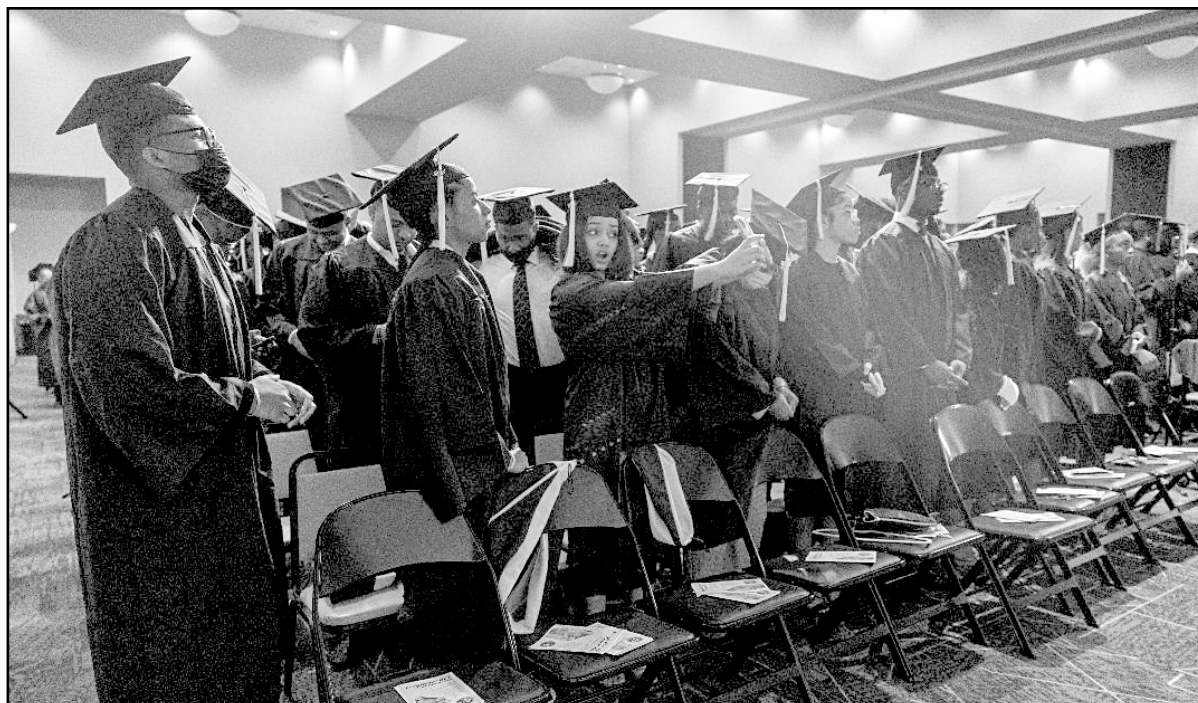
The Class of 2023 participate in Founder's Convocation as they prepare for graduation next year.