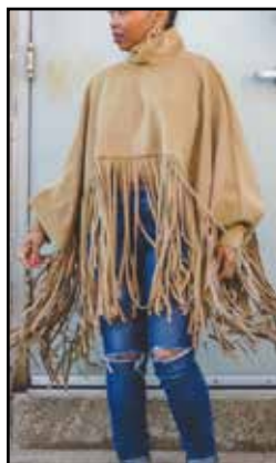
Over Size Fringe Faux Suede Poncho