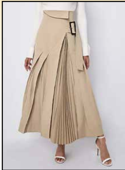
Khaki, Buckle Strap, Maxi Pleated Skirt – shein.com