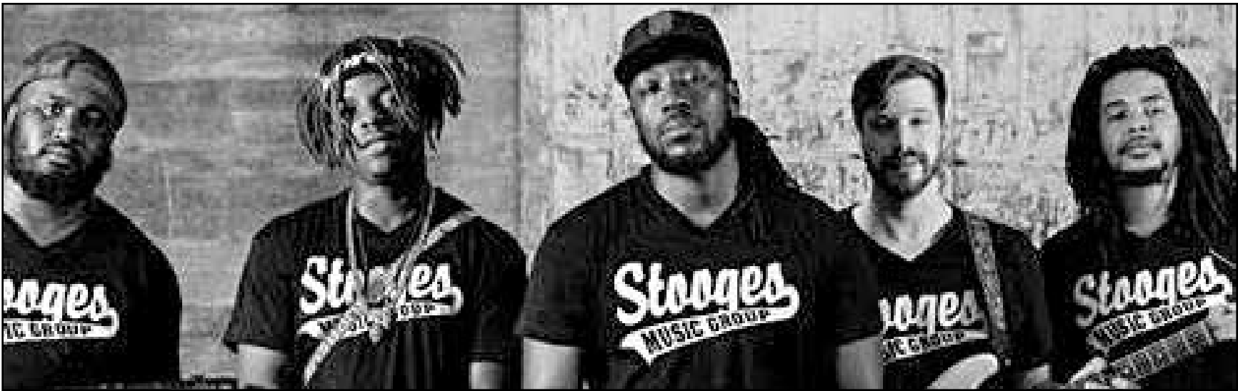
The Stooges Brass Band