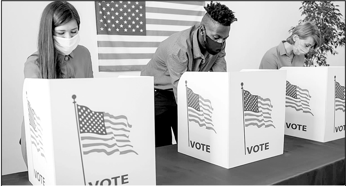
On the ballot is a 5 mill tax that will help fund pre-k education for children in New Orleans.

For those who want to vote absentee; the deadline to request an absentee by mail ballot is April 26th at 4:30 p.m. Also, the deadline for a registrar of voters to receive a completed absentee ballot is April 29th at 4:30 p.m.