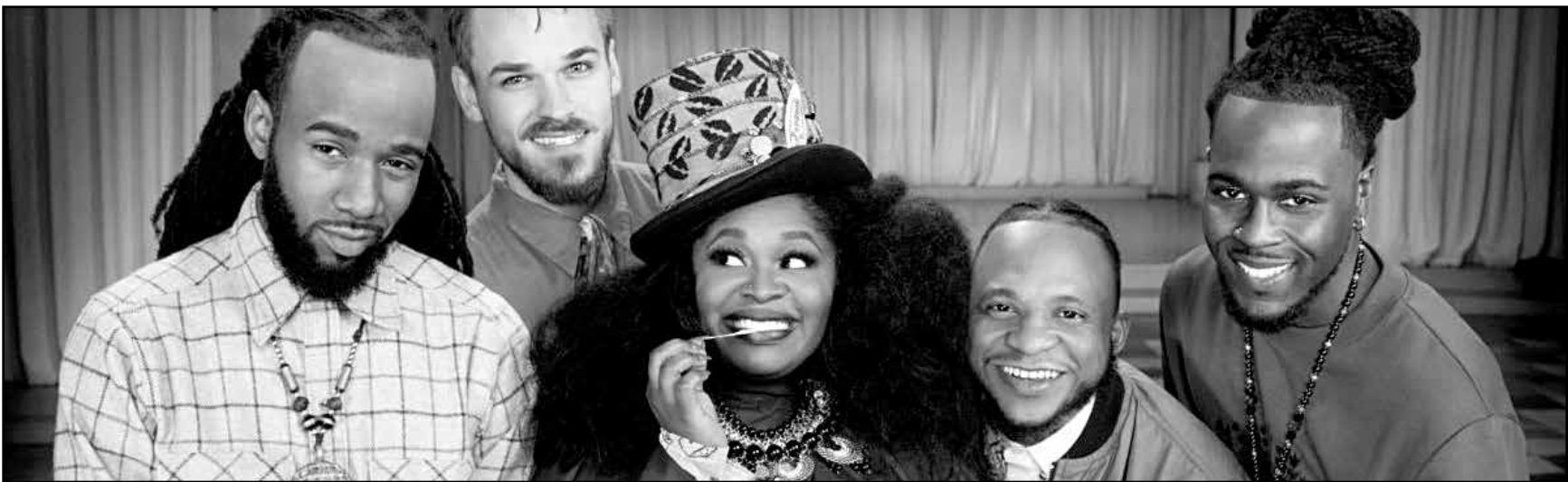
Tank and the Bangas

Festivals are a part of everyday life in New Orleans. It is a place where locals and tourist celebrate life, often flooding the city to come and experience the magic