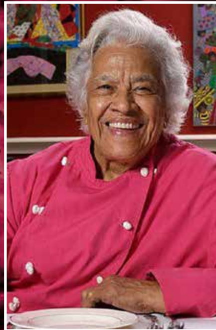
Chef Leah Chase