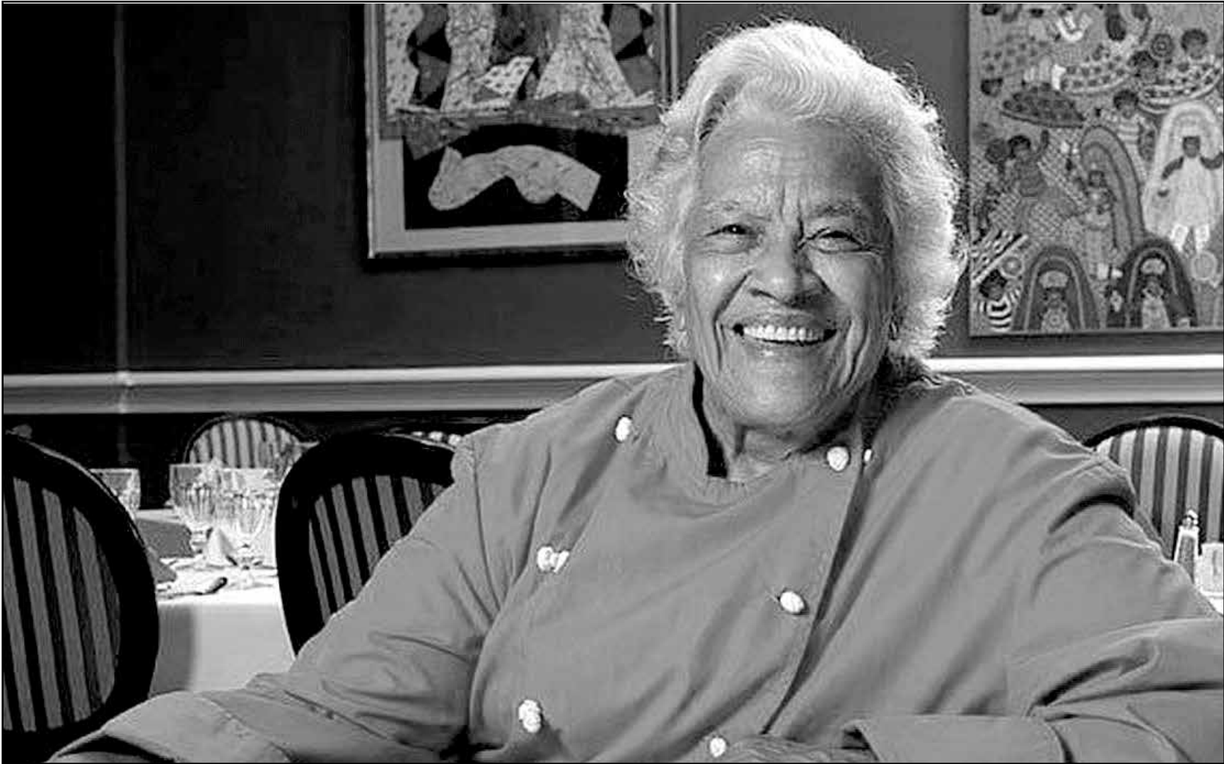
The late great Chef Leah Chase continues to set the bar for culinary excellence.