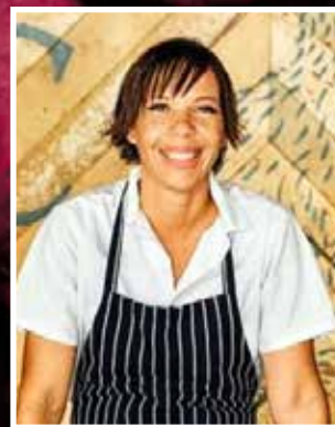
Chef Nina Compton