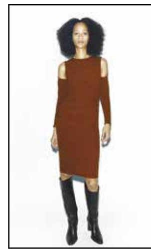
Brown Sugar – Carmel brown, cutout shoulders, long sleeve, knee length ribbed knit dress

Visit ladatanews.com for more photos from these events