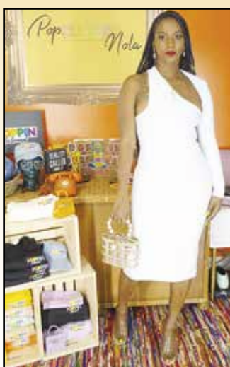
Winter Wonder – Off-White, wrap-shoulder with front cutout, body-con dress