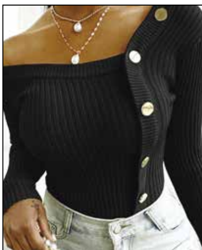
Onyx Only – Black off-the-shoulder knit top with asymmetric gold buttons