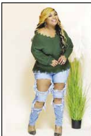
Green Light – Green drop shoulder sweater with frayed collar and hemline; paired with distressed jeans