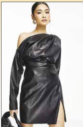
Black Blazing – Off-shoulder faux leather mini dress with tuck detail bodice and side slit

"Shoulders are one of the sexiest parts of the body. Dust your collarbone and shoulders with a splash of highlighter for a polished glow." Charmia Elam, Founder, @mauve.co Luxe eBoutique & Fashion Stylist