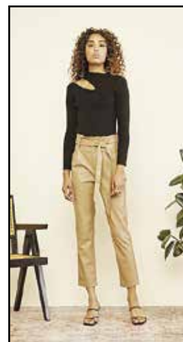
Standing Tall – Black soft ribbed knit top, slit across front and shoulder; paired with Carmel faux pants