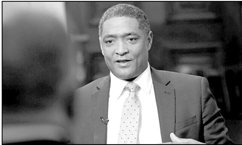
White House Senior Advisor Cedric Richmond promised that the President would continue to make voting rights a theme of his presidency.

The senior advisor to the President was asked why no Republicans support passing voting rights legislation today, despite 16 Republicans