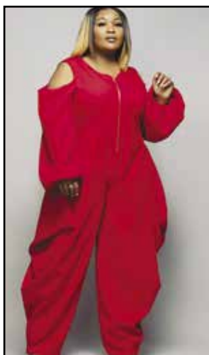
Red Haute – Red, loose fit jumpsuit with long sleeve drop shoulder