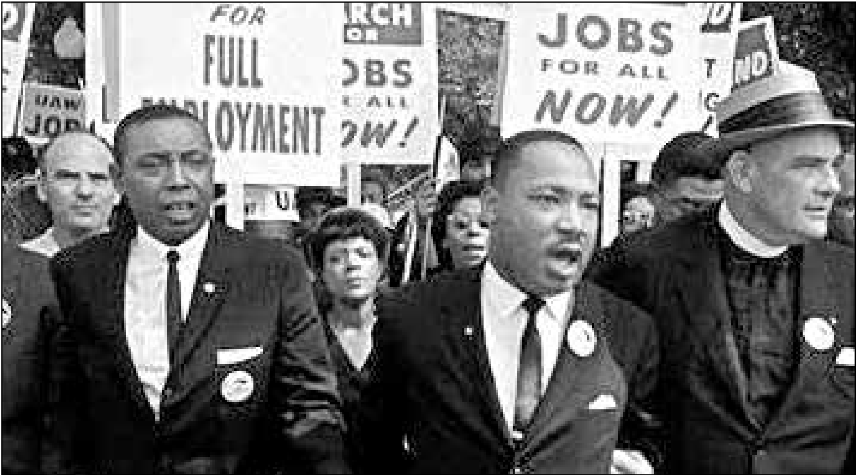
Dr. Martin Luther King Jr., led a movement the Civil Rights Movement that led to many gains for equal rights for African Americans. Today in the 21st century, the struggle continues for justice and fairness in American society.

Benjamin Bates Data News Weekly Contributor The state of MLK’s Dream in 2022, is one that is still illusive, as the United States continue to grapple with how to become a more just humane society. In this day even after the passing of Civil Rights Laws in the 1960’s