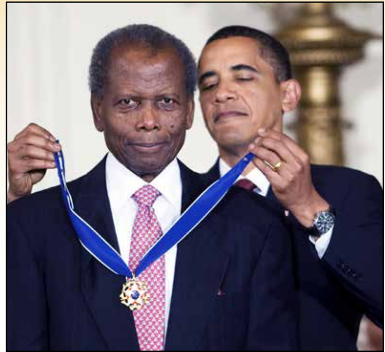
Sidney Poitier was an amazing talent, bringing dignity, class and a commitment to Black Excellence, both on and off the screen. He paved the way for many in the entertainment industry and inspired future generations of African Americans to aspire to greatness.