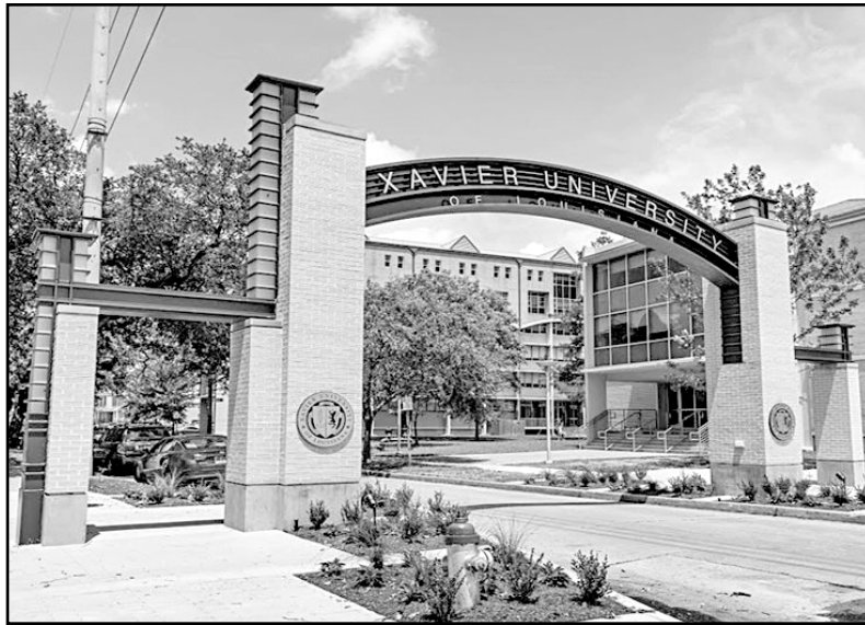
Recently, eight HBCU's, including Xavier University received bomb threats on the same day. Fortunately, all the campuses after their respective campus police and local law enforcement searched for active devices none were discovered.

According to spokespersons from several of the universities, the respective Departments of Public Safety as well as local law enforcement searched the campuses for active devices. All issued "all clear" notices, but some urged their cam-