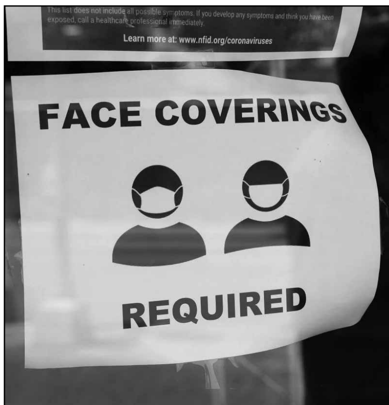
Indoor New Orleans Mask Mandate has been lifted, but New Orleans Mayor LaToya Cantrell is still encouraging all that the Pandemic is not over and to remain safe and follow the science.

For several weeks, COVID-19 cases, hospitalizations and deaths drastically decreased due to the City's more stringent mitigation