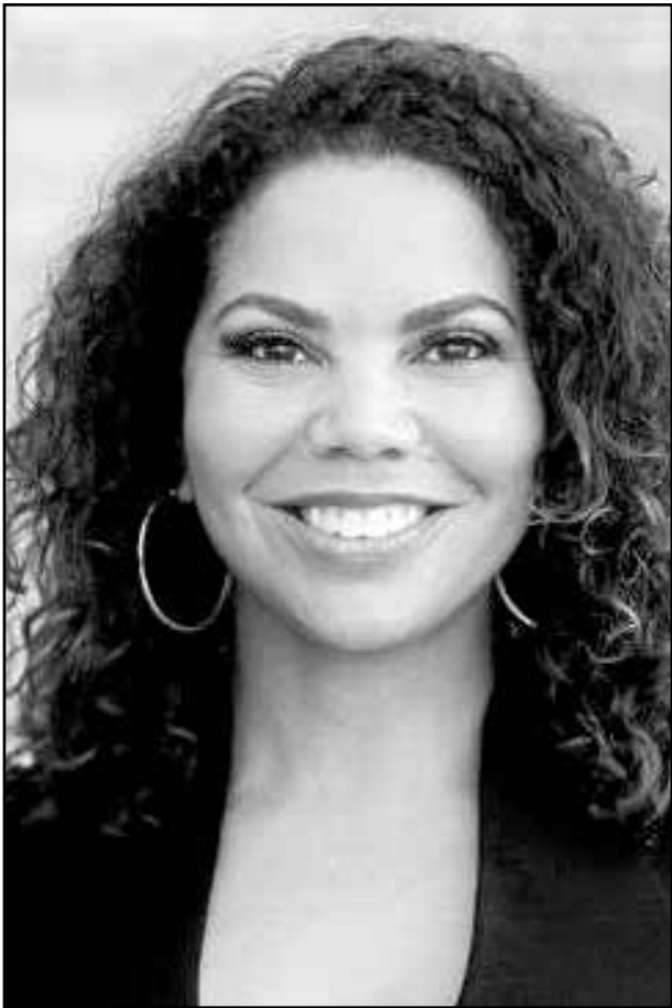
Lesli Harris, Candidate for New Orleans City Council District B.