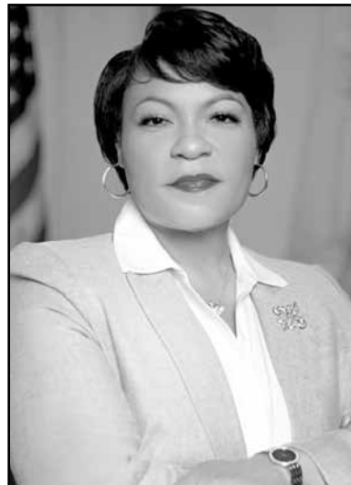
LaToya Cantrell for Mayor of New Orleans.