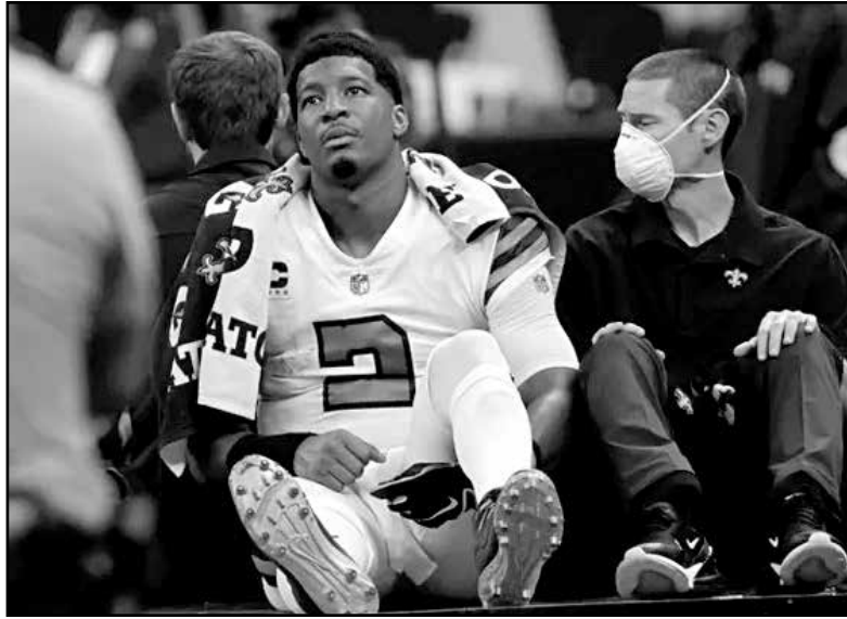
New Orleans Saints Quarterback Jameis Winston, suffered a torn ACL in his left knee and MCL damage that will have him out for the rest of the season. However, despite injuries to Winston and other star players, the Saints are finding ways to win games against some of the leagues best teams.

This is a testament to Sean Payton, and his coaching staff that includes defensive coordinator, Dennis Allen, finding ways to win.