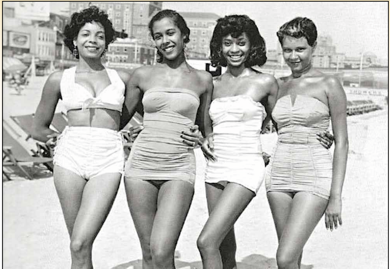
Black Bombshells at the Beach