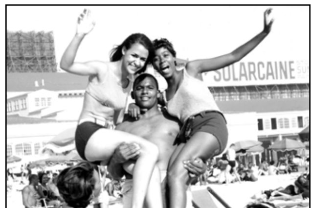
Fun in the Sun