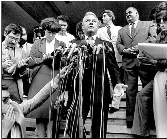
Former Governor Edwin Edwards passed away at 93. He was a transformational figure creating policies that assisted all the people of the state including African Americans.

respiratory problems for several years, according to media reports.