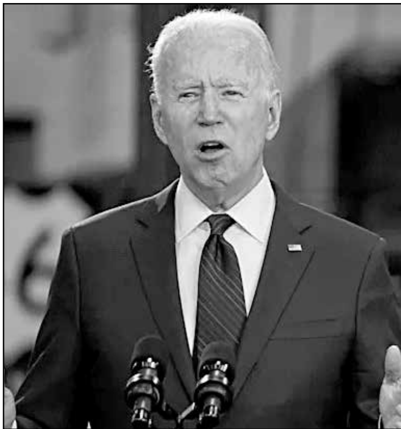
President Biden unveils strategy to reduce gun violence in cities across America.

Since the President's plan was launched, leaders across the country have already responded by taking up or supporting the take-up of these American Rescue Plan dollars for violence prevention efforts. And, as cities, counties, and states