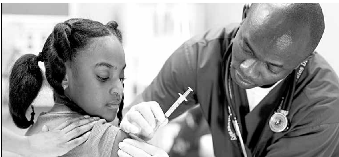
All students who receive both doses from DePaul Community Health Centers will be entered into a drawing to receive a laptop computer courtesy of High Level Speech and Hearing.