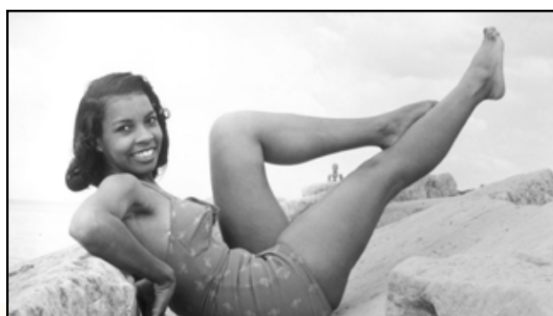
Kick It Up a Notch