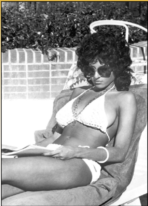
One Bad Chick

It was at the turn of the century when swimming became an intercollegiate and Olympic sport that it was realized a practical design was needed. This paved the way for a more streamline and lighter textile to be introduced. However, with limitations and still modest, of course.