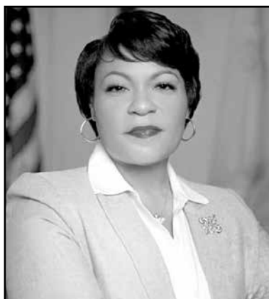
Baton Rouge Mayor Sharon Broome challenged Mayor LaToya Cantrell in a video message over social media. The two then released a joint video message promoting the friendly competition to get people vaccinated in the month of July.

Mayor Broome said Baton Rouge has 41 percent of eligi-