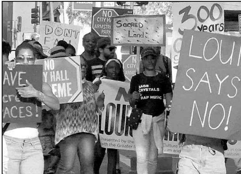
Recently, residents from across the City of New Orleans, came out to voice their opposition to moving City Hall to The Mahalia Jackson Center For The Performing Arts, that's located in the historic Tremé' neighborhood.