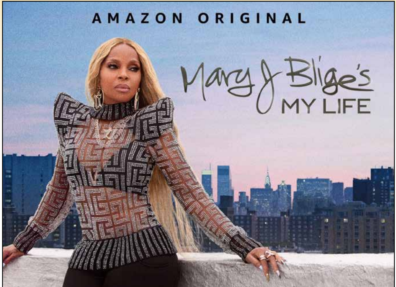
Mary J. Blige amazing documentary "My Life" explores her amazing journey overcoming many obstacles to become not only a force in the entertainment industry, but an inspiration to many.

Living their best lives and using their experiences to be their best selves.