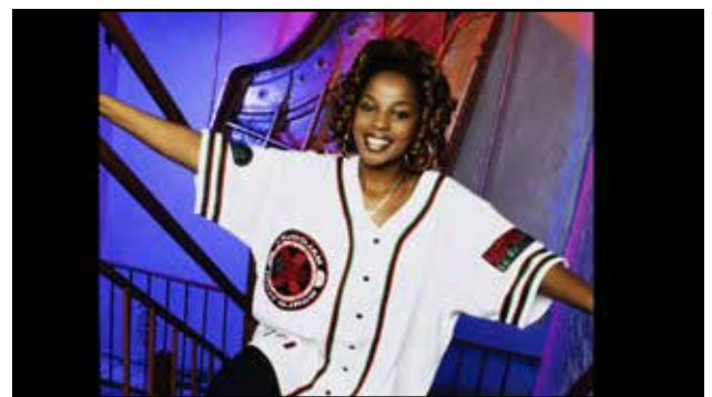
The film chronicles the Queen of R&B Hip Hop, whose innovative sound and style helped redefine R&B. It can be argued that she created the template (the merging of R&B and Hip-Hop) for what is now considered the formula that's been used from the likes of Beyonce, Alicia Keys and many others.