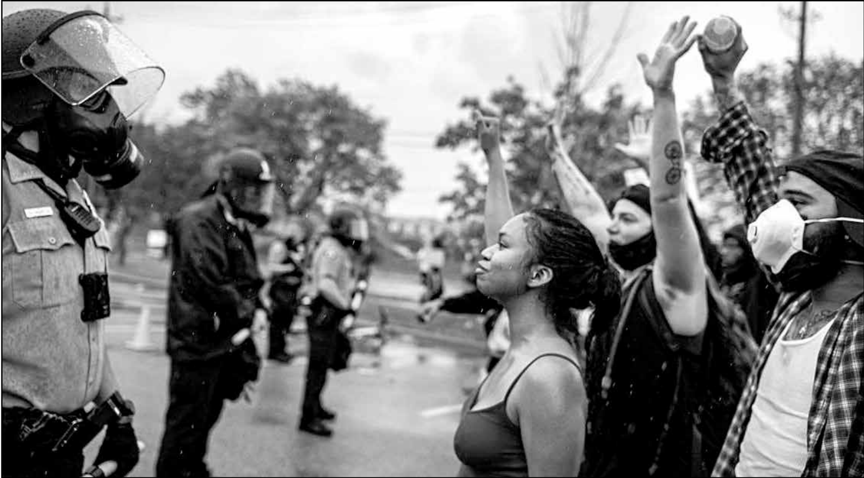
The death of George Floyd by police in 2020 has become a watershed moment where people from around the country of all backgrounds are demanding police reform and an end to systemic racism in America.