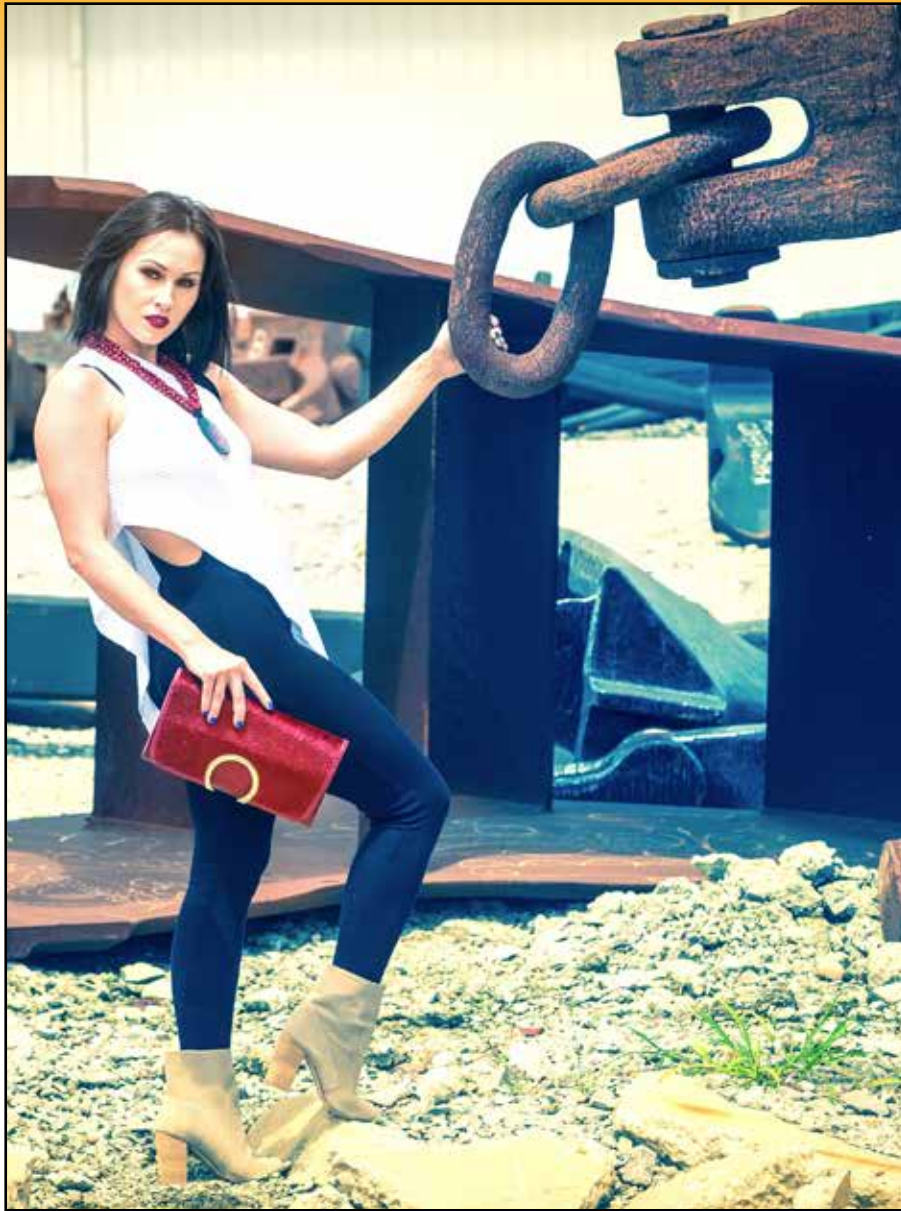
CHAIN REACTION: Black bodysuit legging with white one shoulder, sleeveless funnel sweater, pendant necklace, red clutch, and nude open-toe bootie; all from Maiya