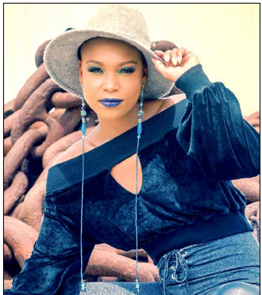
Both Above: Models lip colors available exclusively at Magnolia Makeup: Mood Indigo, NOLA (red) and Shawn. Fall makeup trends will include electric eyeshadows, bold lips, and metallic pigments.