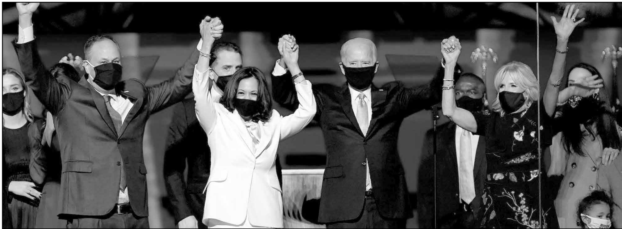
The winning team of Joe Biden and Kamala Harris celebrating with family after being declared victorious in the 2020 Presidential Election.