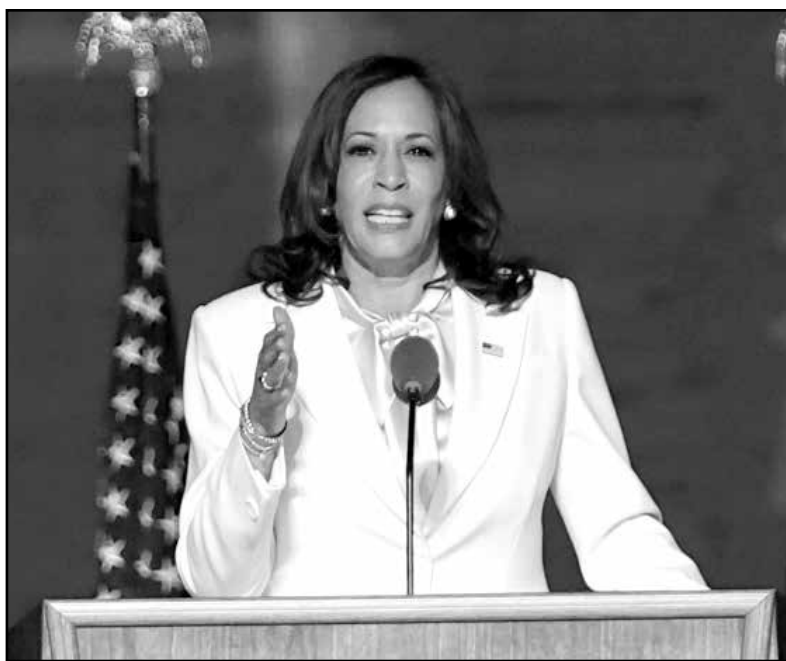
Vice-President Elect Kamala Harris is making history as the first woman to hold the office of the Vice-President. This is of special significance because she is a woman of color.

The time has come for real conversations about who we are and where we are headed as a country that's changing demographics by 2050 where it is estimated that the country will no longer be majority White. To some this is a daunting