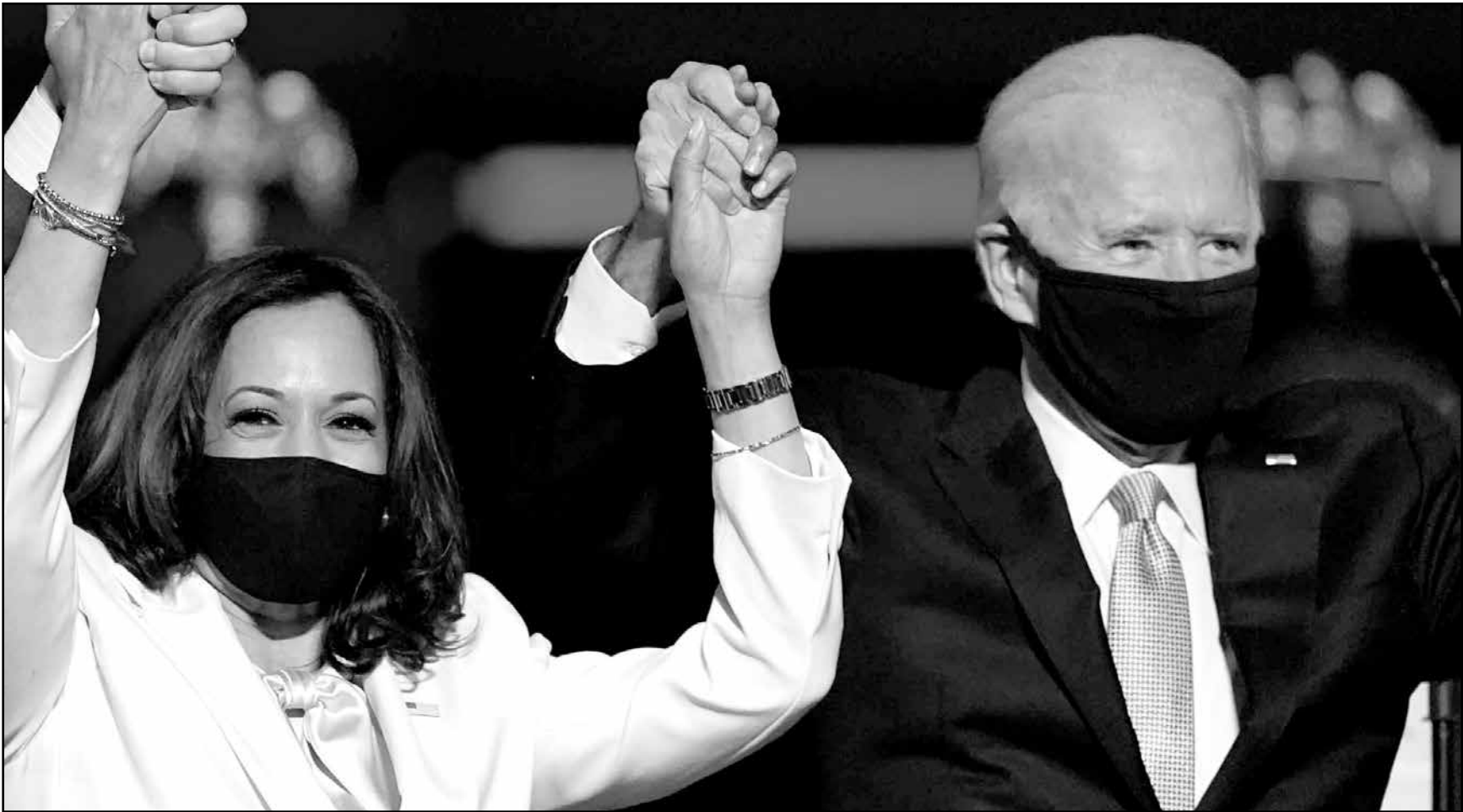
President Elect Joe Biden and Vice-President Elect Kamala Harris.

Joe Biden and Kamala Harris Wins 2020 Presidential Election Making History