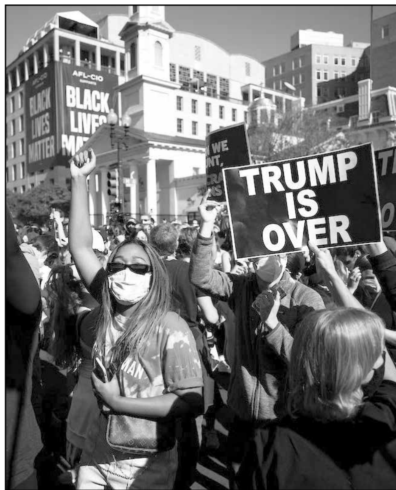
People from all walks of life celebrated in the streets upon hearing the announcement that Joe Biden had won the Presidency.

America is still in a state of uncertainty to what it will be in these divided times, but the job of the President is to set the tone for the country. Donald Trump brought out the worst in many and was the lighter fluid that made the flames of intolerance and incivility worse.