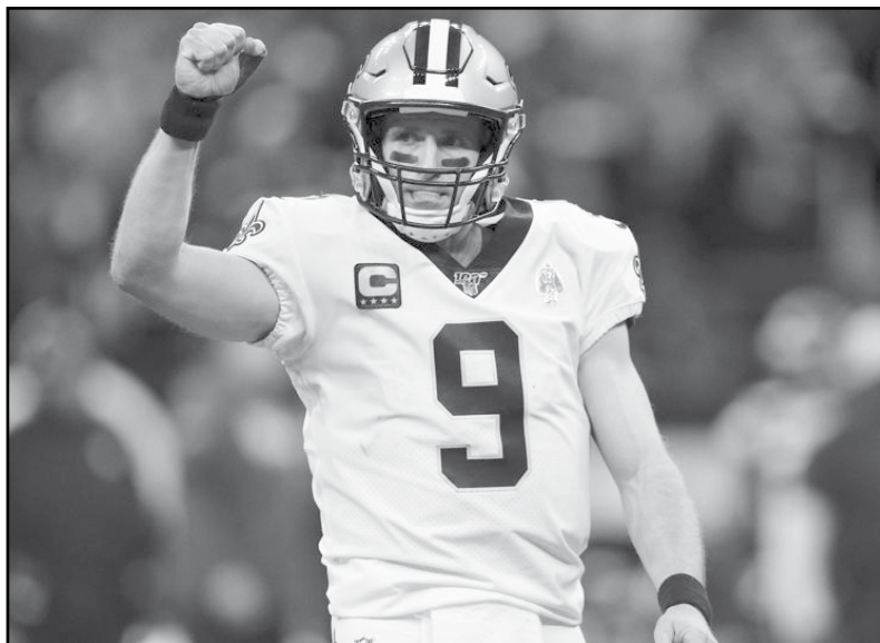
Drew Brees, is leading a Saints team who is leading the NFC South Division during mid season and is in contention again to win its division.

Drew Brees showed that he is arguably the best quarterback of his generation. Also, this season the team is doing it on both sides of the ball. In this last game they shut down Brady and the high-