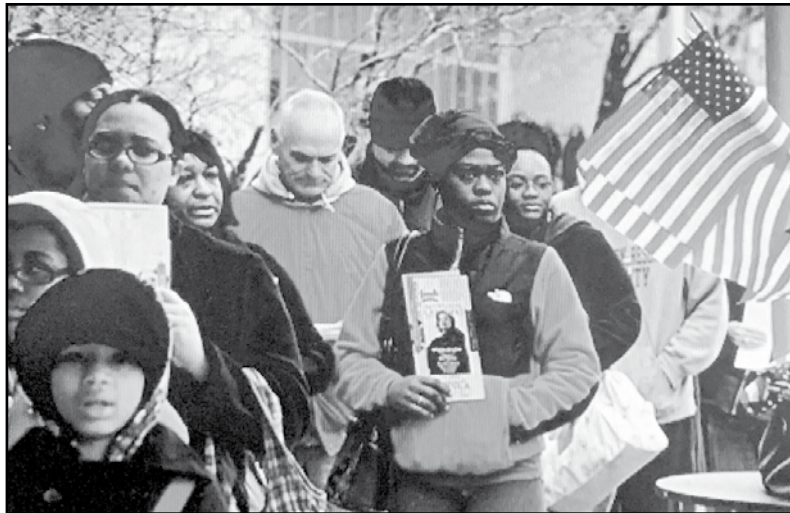
Voters across the U.S. went out in record number to vote in the 2020 Presidential Election. President-Elect Joe Biden during his acceptance speech that called for unity; he also gave special thanks to the outpouring of support from the African-American community.

"This election is about so much more than @JoeBiden or me. It's about the soul of America and our willingness to fight for it," Sen. Kamala Harris, the Vice President-Elect tweeted alongside a video. "We have a lot of work ahead of us.