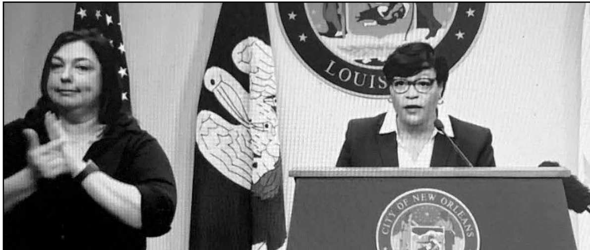
New Orleans Mayor LaToya Cantrell, announcing that the City would be entering Phase 3.3 reopening.