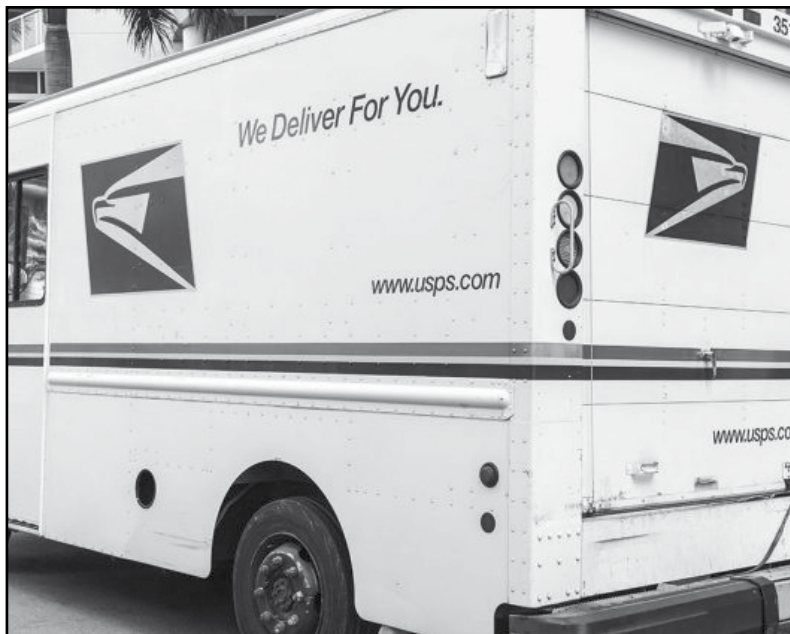
Slowdowns at the post office have reportedly also resulted in seniors receiving their medications late and other important mail like social security checks.

Despite recently voting with his wife by mail in a Florida primary election, the president said he's against mail-in voting.