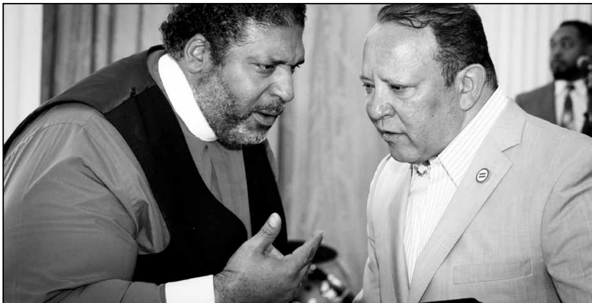
Morial is concerned about the problems of Crime and Gun Violence. Speaking of his time as Mayor of New Orleans and approaches he believes work he says, "As Mayor of New Orleans, I oversaw a 60% reduction in violent crime which we achieved through a combination of reforms that helped to restoring trust between the police department and the community and investing in economic initiatives like summer jobs for youth. We also need a comprehensive National Gun Safety Policy." (Marc Morial with Poor People's Campaign Chair, Rev. William Barber).

tice in Policing Act and Morial and the National Urban League is co-convening the Census Roundtable, with Fraternal, Business, Civic and the Faith Community around the 2020 Census and getting Blacks to participate in the 2020 Census.