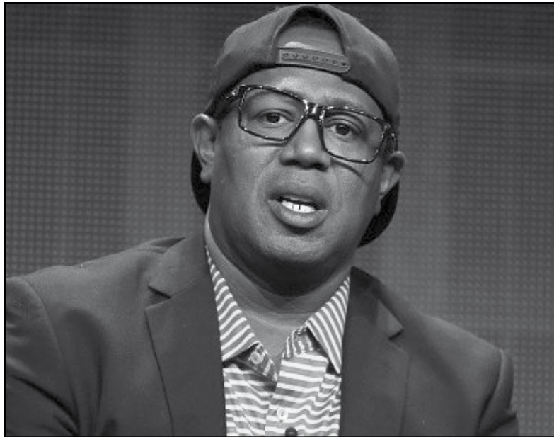
Percy Miller (Master P) was as many shocked by this sad event and says the senseless killing must stop and is something that is plaguing communities throughout America.

The statement listed the deaths as homicides. Louisville Police as of