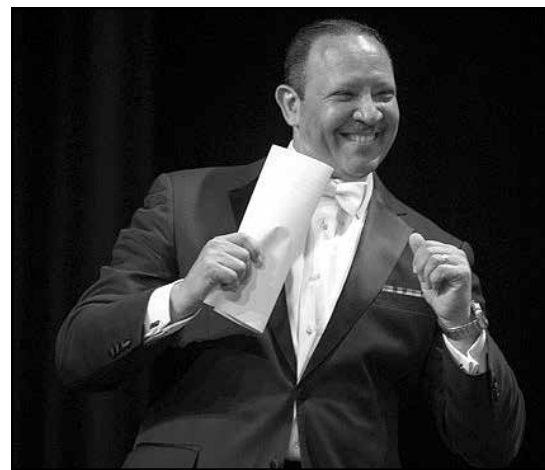
Morial believes today's Civil Rights Struggle is not just about how it impacts the African American community but affects the entire nation. One that many came on different ships but are now in the same boat.

"Black people should vote as if their lives depend upon it because they do. For all of the reasons that are laid out in this report, the tri-