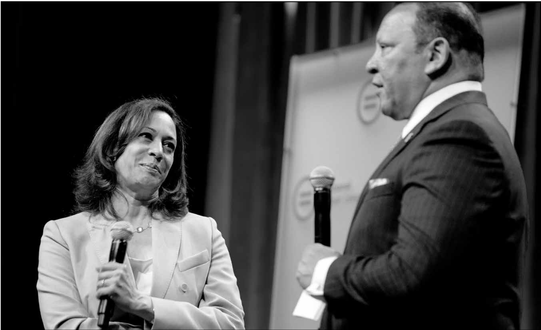
“We titled this year’s report “Un-masked” because the events that have unfolded this year have laid bare the face of racism in America,” says Morial regarding the recent release of the National Urban League 2020: State of Black America. (Marc Morial with 2020 Vice-Presidential Candidate Kamala Harris).