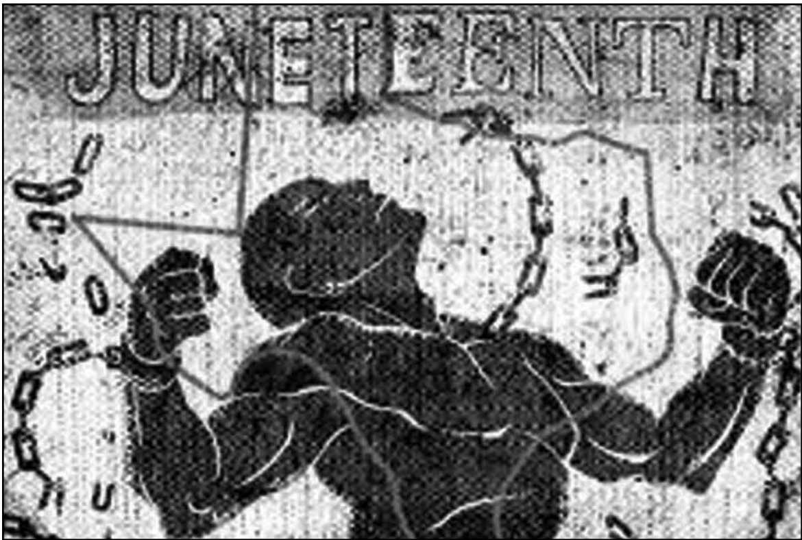
Today celebrating Juneteenth is more important now than ever because it is time for America to truly grapple with its legacy of slavery.

In the face of the racial crisis in America, it is an important time for Blacks in their continued struggle for equal rights and justice. This is the backdrop of this year’s Juneteenth, one where the nation will be elect its next U.S. President. Interest in the holiday have been renewed and a push to make it a holiday in many states and for that matter the nation is on the rise.