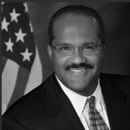
SENATOR TROY CARTER

"I love New Orleans. I am a product of New Orleans and I am committed to New Orleans First." EARLY VOTING JUNE 20—JULY 4, 2020