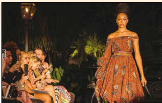
Designer: Soleo