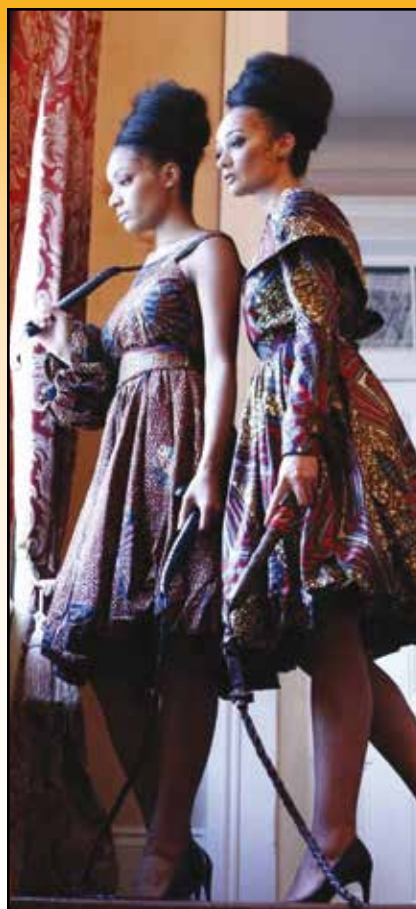
Designer: Soleo