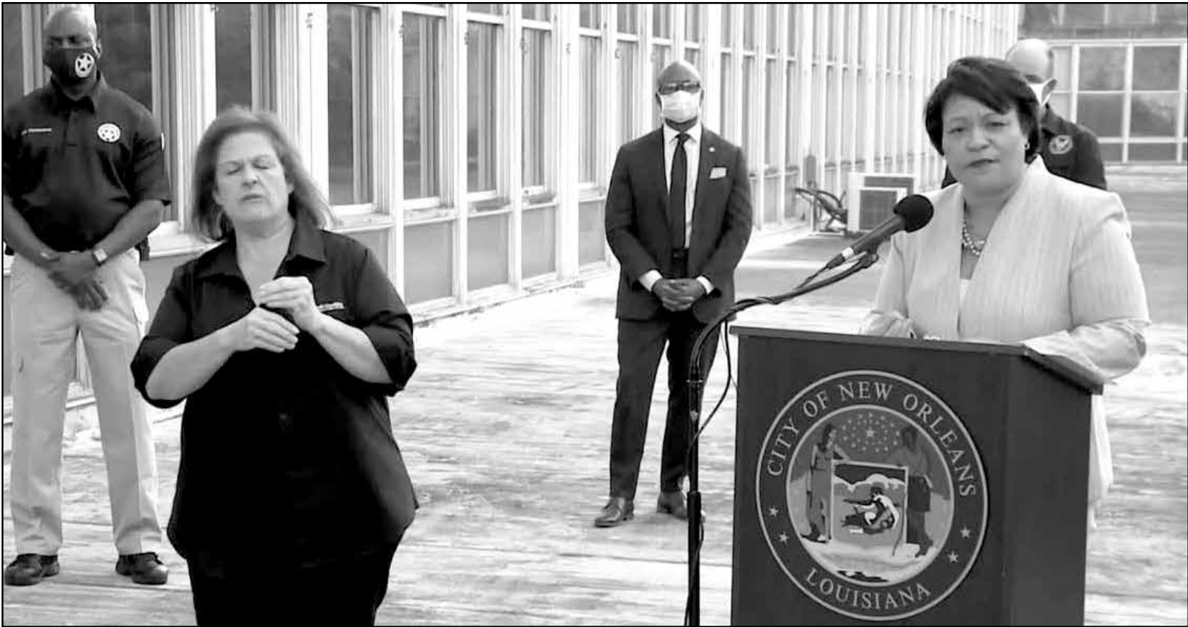
New Orleans Mayor LaToya Cantrell has ordered an end to two-month Stay-At-Home Order and begin Phase One of the City Reopening. It is part of a phased in approach to the City re-opening in response to the COVID-19 Pandemic.

In the face of the COVID-19 Pandemic it's created a New Normal for us all. As we move into a phased approach to re-opening, we at Data New Weekly as the "People's Paper" wanted to give our citizens information about how in New Orleans the process will occur.