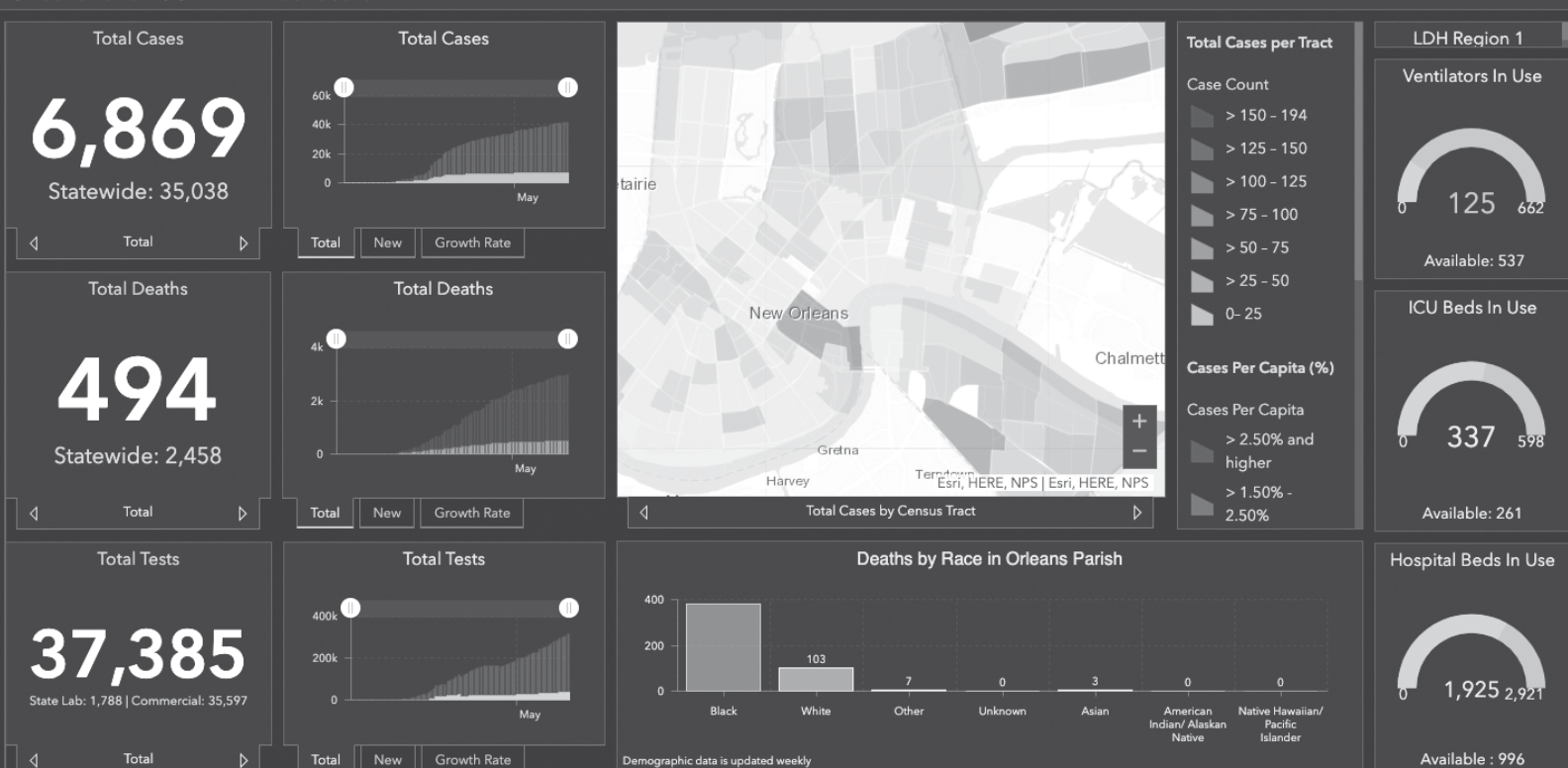
Orleans Parish COVID-19 Dashboard

Statistics on COVID-19 cases in New Orleans. It shows more African Americans are dying from COVID-19 than other groups. This also speaks to larger issues of health disparities that make the African American population more vulnerable. It is something that's created conversations around reversing this trend.