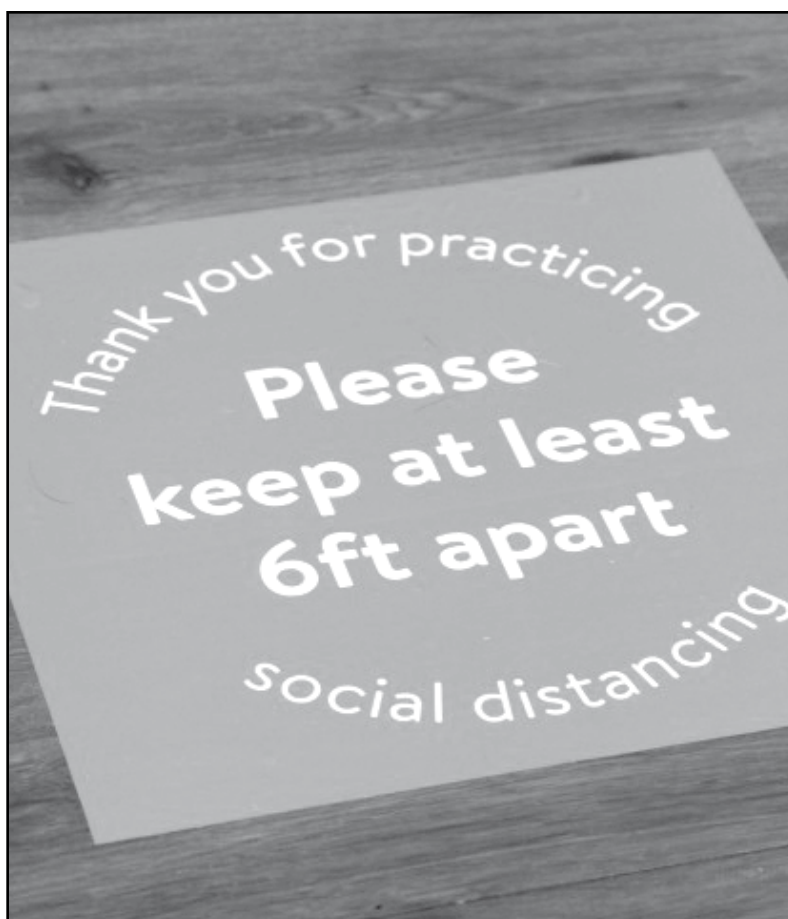
The New Normal...Social Distancing.

Statistics on COVID-19 cases in New Orleans. It shows more African Americans are dying from COVID-19 than other groups. This also speaks to larger issues of health disparities that make the African American population more vulnerable. It is something that's created conversations around reversing this trend.