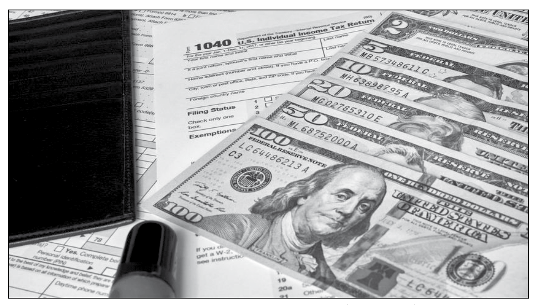
Most Americans are eligible for and will receive stimulus payments. Single-filers who make less than $75,000 will receive $1,200, while married couples making less than $150,000 are scheduled to get $2,400. An additional $500 will be provided to households for each child under seventeen.