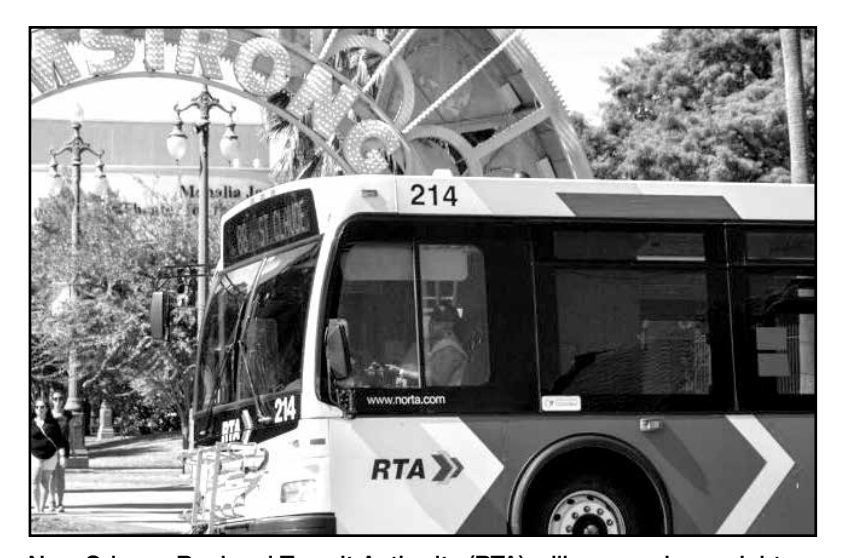
New Orleans Regional Transit Authority (RTA) will suspend overnight service on most bus and streetcar routes between the hours of 10 p.m. to 4 a.m. in response to the COVID-19 Pandemic.

service Sunday through Saturday, following the normal Saturday