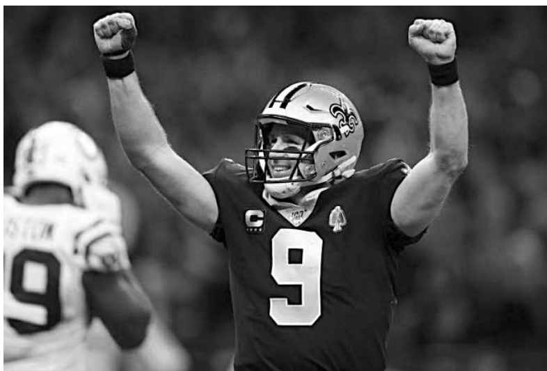
Number 9 continuing his quest to be the best and greatest of all time.

Brees also completed 22 passes in a row, another record, while along the way, wide receiver Mi-