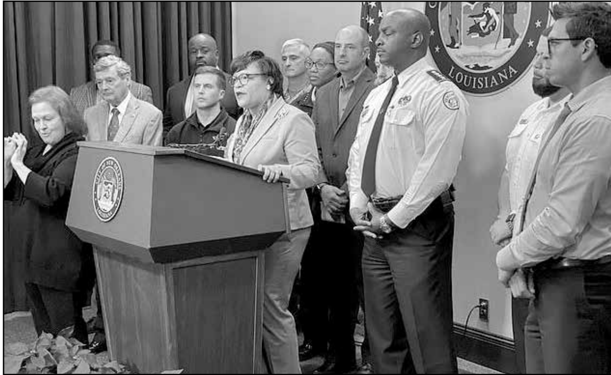
New Orleans Mayor LaToya Cantrell holds press conference surrounded by City leaders after cyberattack.

The attack began at 5 a.m. CST, according to the City of New Orleans' emergency preparedness campaign, NOLA Ready, Managed by the Office of Homeland Security and Emergency Preparedness. NOLA Ready tweeted that "suspicious activity was detected on the City's network," and as investigations progressed, "activity indicating a cybersecurity incident was detected around 11 a.m."