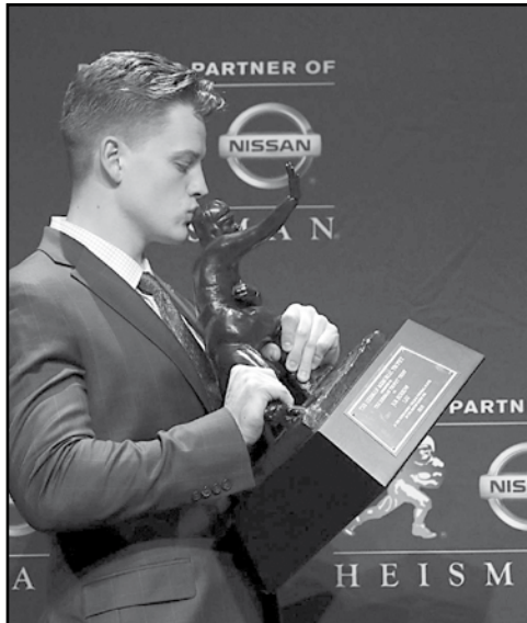
Joe Burrow Kissing Heisman Trophy.

And the voting wasn't even close. Burrow received 841 first-place votes with the second-place finisher, Ohio State DL Chase Young received the second-most first-place