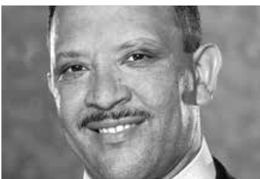
Marc Morial President and CEO National Urban League

NEW YORK - The theme of World AIDS Day 2019, which took place on Sunday, is "Communities make the difference."