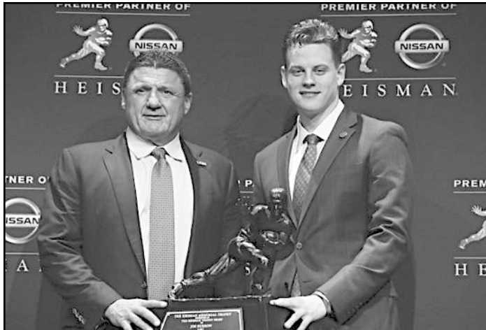
Joe Burrow knows that this is not just about him, but his teammates and coaches are important in making his record-breaking season possible. L-R LSU Football Coach Ed Orgeron and Joe Burrow during Heisman Ceremony.

votes who had only 20 votes. Burrow had the highest percentage of first-place votes and recorded the largest margin of victory in Heisman history.