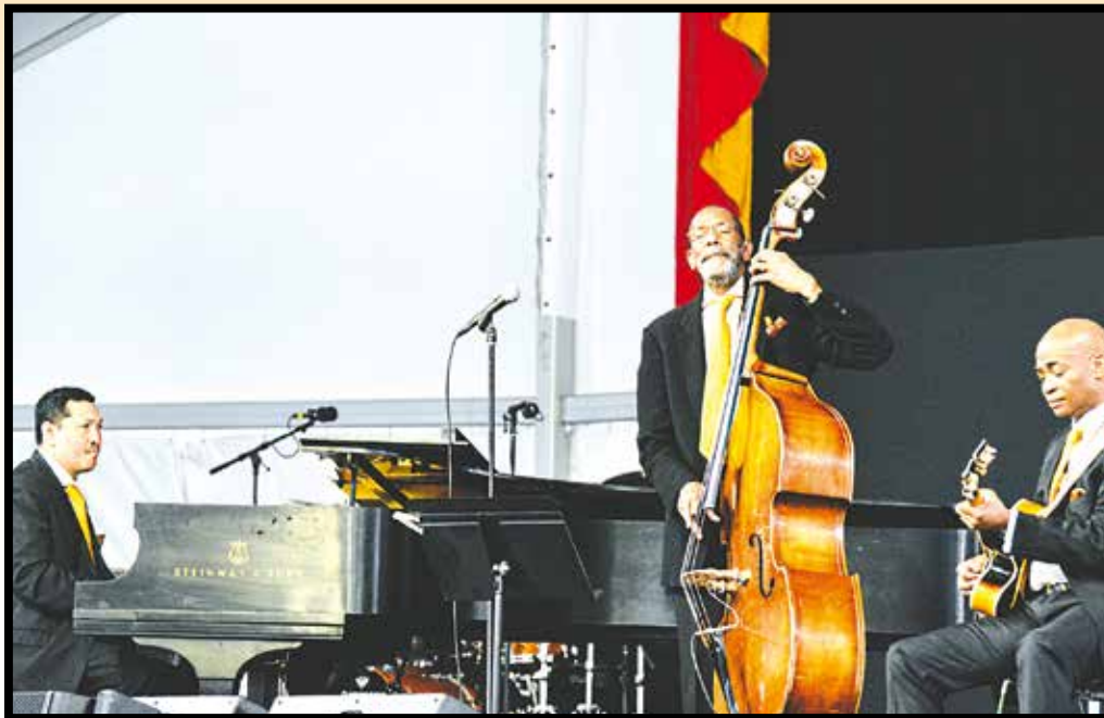
Ron Carter Trio

With none of the weather shenanigans that cancelled the first day of the French Quarter Festival, The 49th Annual New Orleans Jazz & Heritage Festival rolled in with plenty of sunshine, amazing food and an incredible array of musical acts from around with country this past Friday through Sunday. The Fairgrounds was host for the first half of the famed event, with that included Common, Kidd Jordan, Bobby Rush, The Ron Carter Trio, Big Freedia and Big Chief Donald Harrison. One of the standout moments on Saturday was an all-star tribute to the late Fats Domino featuring an all-star array of contributors that included Davell Crawford, Irma Thomas, Jon Batiste and more performing some of Fats' most beloved songs." The second week will be as great as the first, so of course, Data will see you there!!!