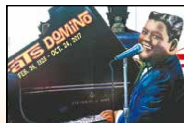
Fats Ancestor Installation