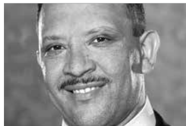
Marc Morial President and CEO National Urban League

"Investing to support the launch and growth of Black-owned businesses could build wealth for individuals and their families, assist with closing the wealth gap, revitalize communities, and contribute to an overall healthier economy, which benefits us all. To do so, thoughtful and innovative approaches are required to overcome the exponential effects of the interplay among the wealth gap, the credit gap, and the trust gap. While challenging, this is worth striving for so that we can move one step closer to an inclusive