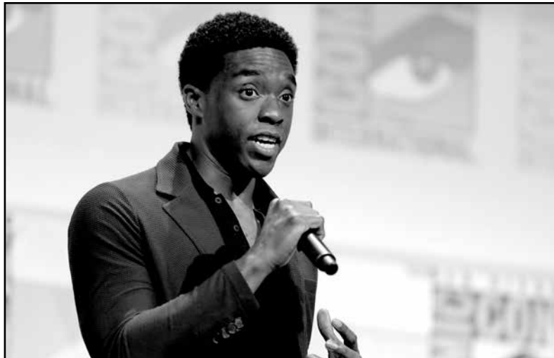
"Black Panther" star Chadwick Boseman will deliver the keynote address during Howard University's 150th Commencement Ceremony. In this photo, Boseman speaks during the 2016 San Diego Comic Con International at the San Diego Convention Center in San Diego, Calif.

Boseman graduated from Howard University and attended the British American Dramatic Academy at Oxford. Boseman can currently be seen starring as T'Challa/