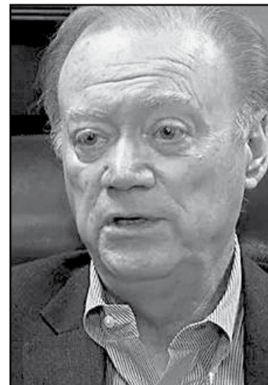
Scandal embattled Louisiana Secretary of State Tom Schedler submitted a letter of resignation to Gov. John Bel Edwards on Tuesday morning. The letter gives an effective date of May 8.

The Republican previously announced plans to stay until his term ended in January 2020, de-