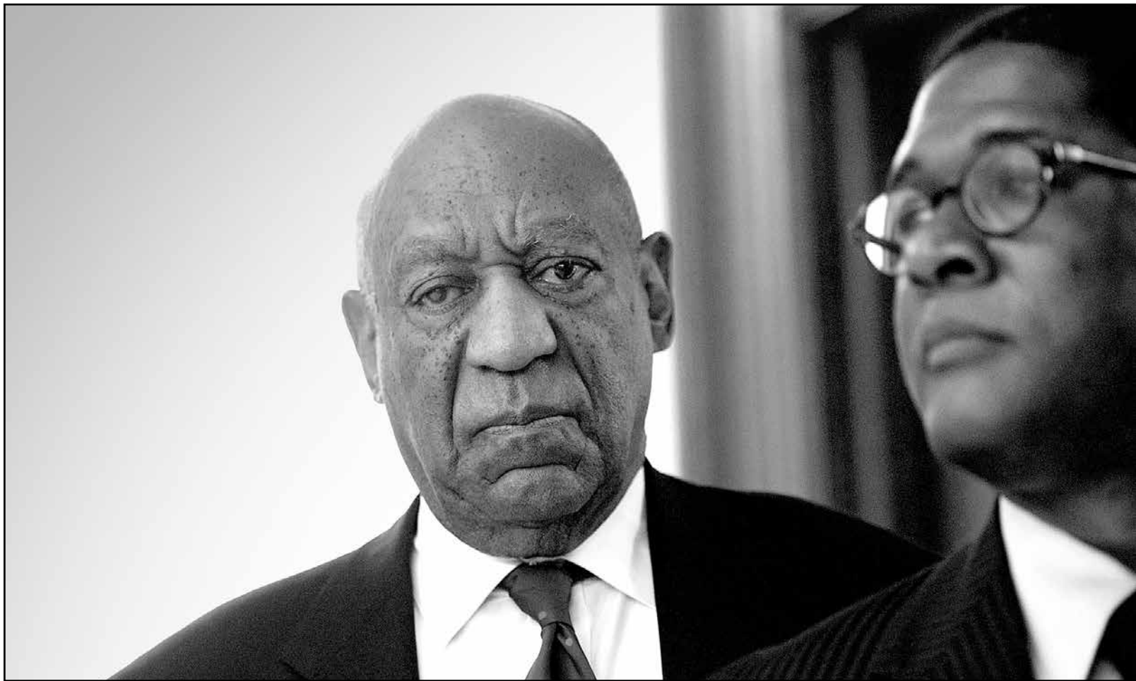
A Norristown jury found comedian Bill Cosby on three counts of aggravated indecent sexual assault. Some legal experts said that Cosby might get another trial.