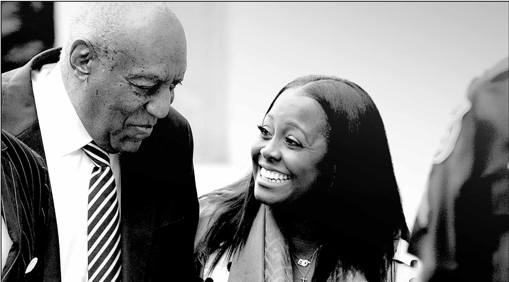
Accompanied into the courthouse by a member of the TV family who cemented his nice-guy image as America's Dad, Bill Cosby went on trial Monday on sexual assault charges, his legacy and his freedom on the line.