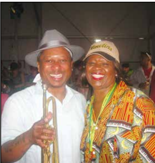
Kermit Ruffins &amp; Irma Thomas