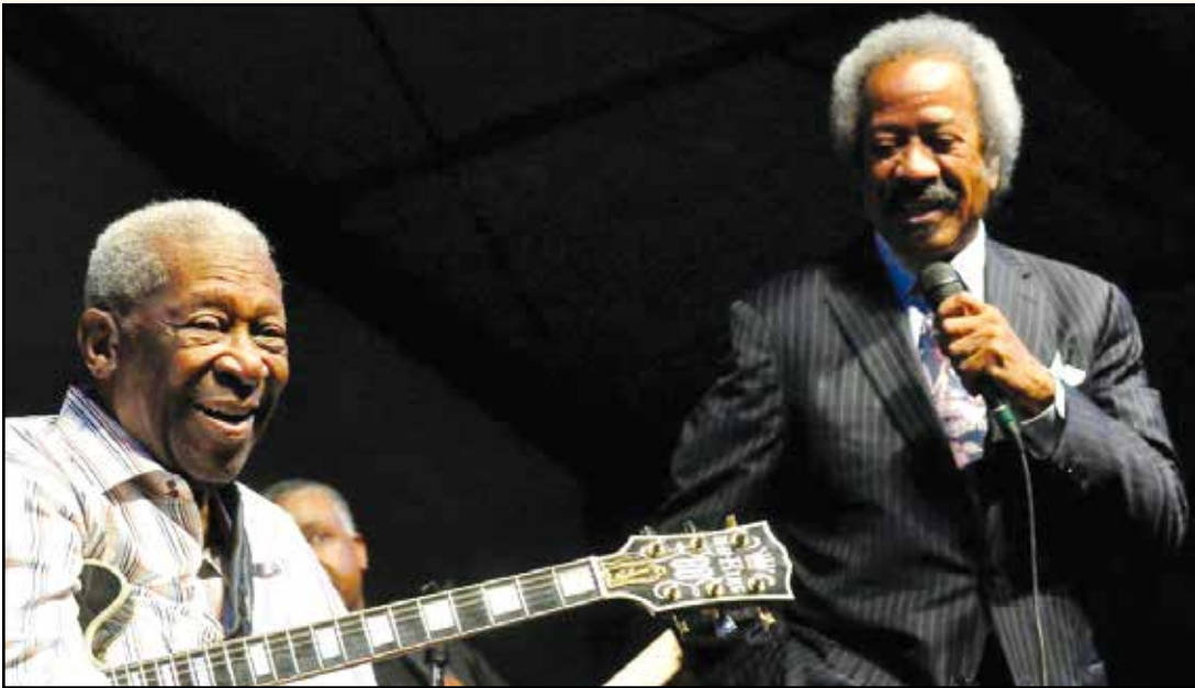
BB King and Allen Toussaint

The 2013 New Orleans Jazz and Heritage Festival began last weekend, featuring local, regional and national talent and drawing fans from around the world. The Jazz Fest continues this weekend at the Fairgrounds, and Data will be there too!