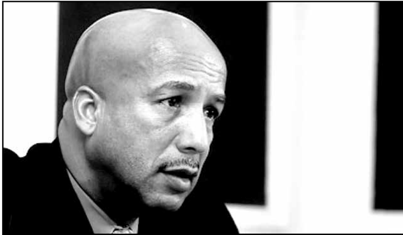
Former New Orleans Mayor C. Ray Nagin

contractors in exchange for more than $200,000 in kickbacks and first-class trips to Hawaii, Jamaica and Las Vegas. If convicted on all charges, he could receive more than 15 years in prison.