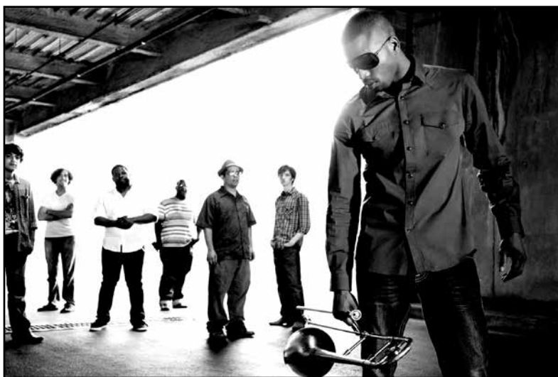
Trombone Shorty & Orleans Avenue

Verizon Super Bowl Boulevard, on the grounds of the Audubon Institute's Woldenberg Park, will feature a four-day lineup of local music artists, popular food and beverage offerings, live national television broadcasts, interactive fan events, and the iconic larger-than-life Super Bowl roman nu-