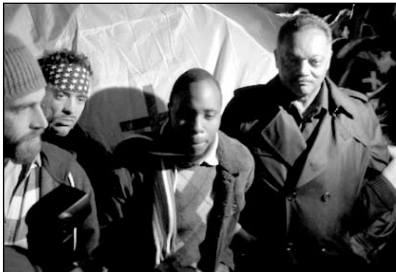
Rev Jesse Jackson visited Occupy Wall Street in New York to support the movement this week.

Frustration over the state of the economy and the lack of jobs, while Wall Street and mem-