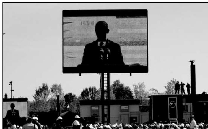
President Obama addressed the crowd by satellite at the Martin Luther King Jr. Memorial Dedication Rally in Washington, D.C.