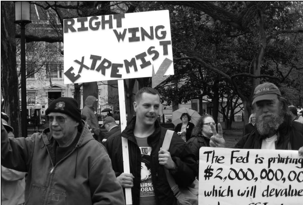
This man's sign reads Right Wing Extremist. A mere two year ago, signs and actions such as these would have been kept hidden, but today, is now more commonplace and in the open as racial tensions have grown since the campaign and election of President Obama.