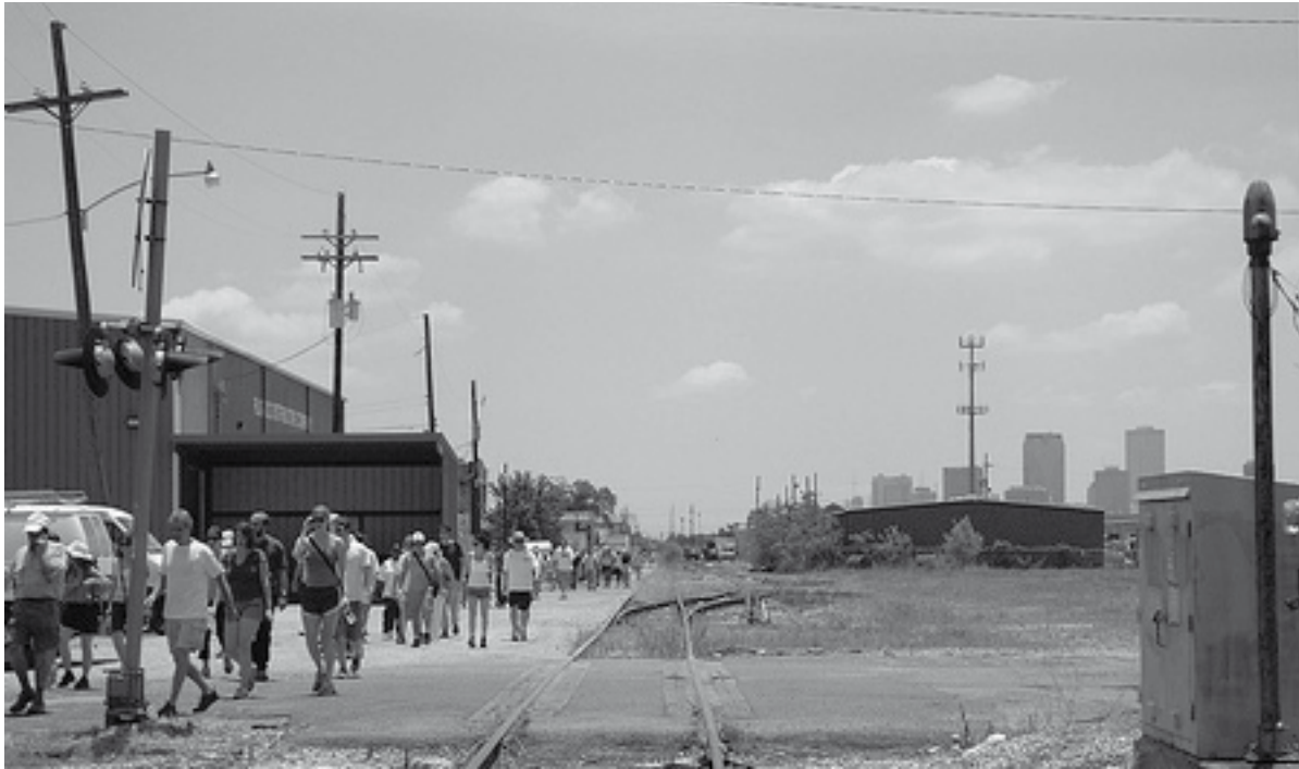
Members of the Friends of Lafitte, walk the new site of the Lafitte Greenway. The Lafitte Greenway will establish a corridor of connecting parks, bike trails, and open public spaces for the neighborhoods through which it winds

The Lafitte Greenway will establish a corridor of connecting parks, bike trails, and open public spaces for the neighborhoods through which it winds. While