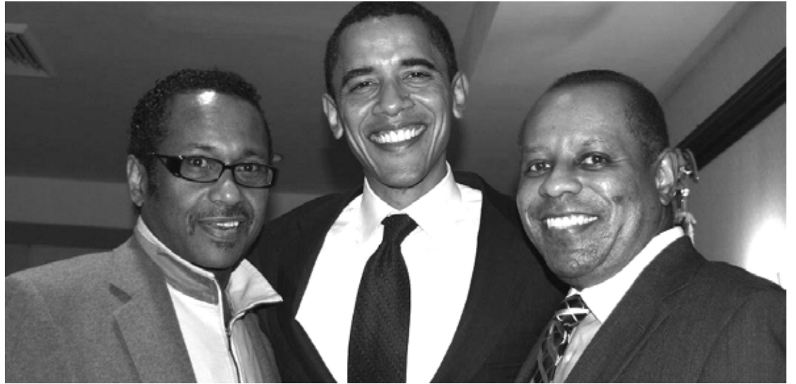
Data News Weekly Publisher Terry Jones and Presidential Candidate and Senator Barack Obama (D-IL) stop for a photo during a legislative meeting between Congressional Black Caucus Members and members of the National Newspaper Publishers Association during Black Press Week.

WASHINGTON (NNPA) - U. S. Sen. Barack Obama, a leading candidate for the Democratic nomination for president, has denounced reports of a rivalry between him and former presidential candidate Al Sharpton. In response, Sharpton has all but declared that he will not run again for the Democratic nomination.