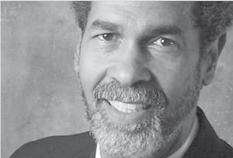
The Love Dr. Data Columnist