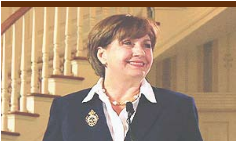
Blanco Calls It Quits Page 4