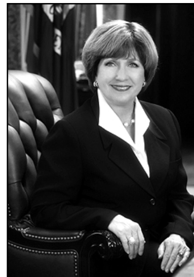
Gov. Kathleen Babineaux Blanco, is the first woman to be elected to the office.

Blanco's sudden announcement came after several weeks of speculation about whether she would remain in a race she seemed seamed likely to lose. Some Democrats have been pressuring her for months to step aside for a stronger party candidate. Congressman William Jefferson (D-La.) was somewhat surprised at Governor Blanco's announcement that she will not be seeking re-election. He pointed